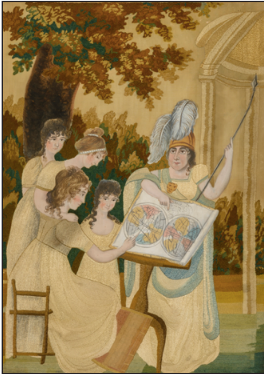
Figure 2 - Wisdom Instructing Youth in the Science of Geography, United States; about 1800. Silk embroidery and paint on silk ground.