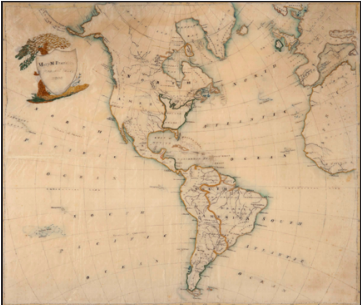
Figure 1 - Needlework picture, worked by Mary Franklin. Pleasant Valley, NY; 1808. Silk embroidery with watercolor and ink on silk.