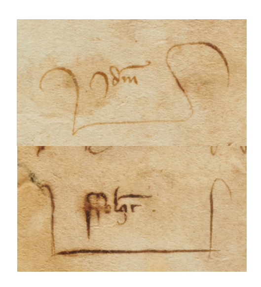
Figure 3. Detail of two rubrics, fols. 8v (above) and 13r (below).