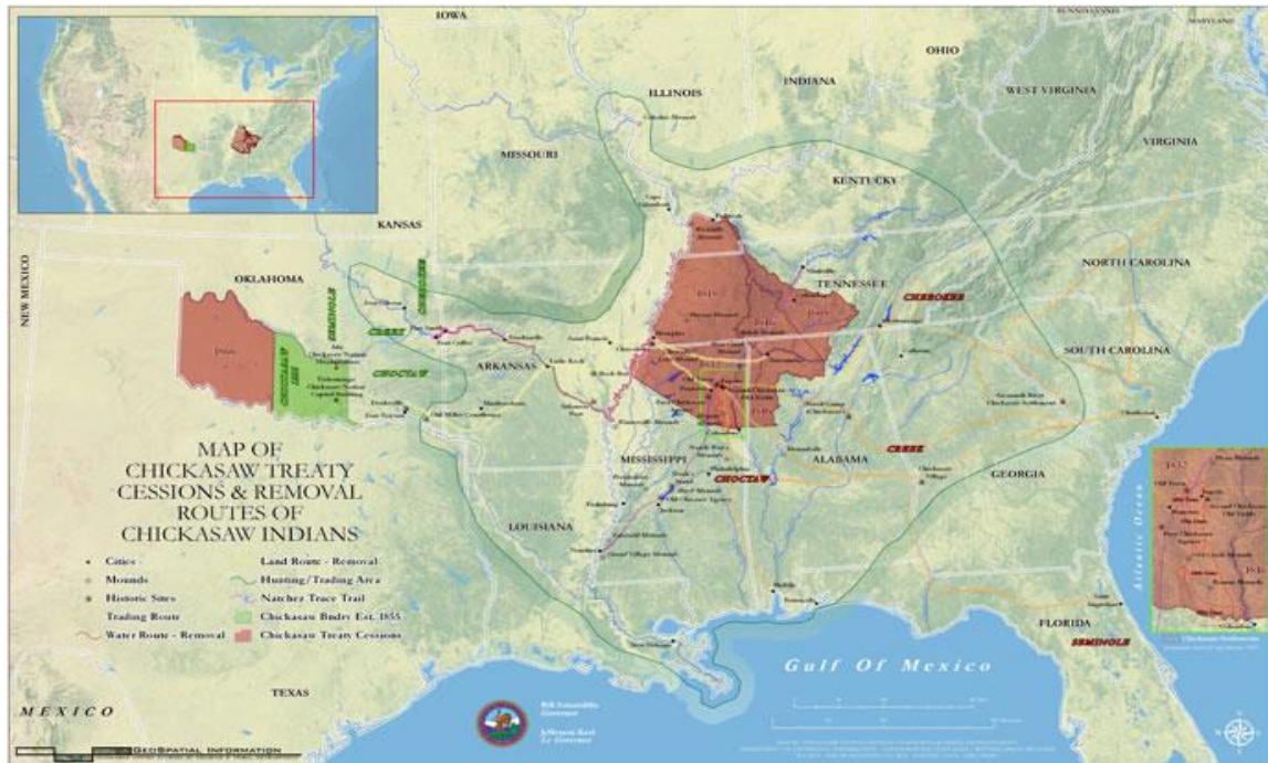
Image 1: Map of the Chickasaw Treaty Sessions & Removal Routes of Chickasaw Indians, Chickasaw Nation GeoSpatial Information, 22 February 2012

Chikashsha oklaat onahmat inchipota alhiha holissaapisa' pilachittoo. Naahollimanompa' ithana'ni bannattoo. Pomanompa'at impállaminatookookya kaniya'ookya iláyya'shakmat Chikashsha ilittimanompohóli katihma. 1970 paafka Chikashsha sipóngni' alhihaat Chikashsha himitta'at Chikashshanompa' ikanompo'lo imahooba. Haatokoot dictionary aachika holissochit ishtaya'na kanilahoot chipota himitta' ithanachit ishtayattoo, aachi.