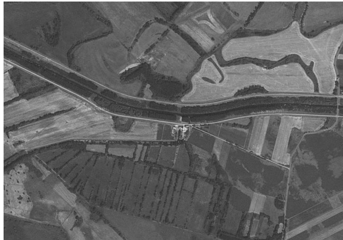
Figure 2. Footprints of landscape history (remnants of river-regulation and medieval canal system)

The region of Hanság is characterized mostly by rural areas encompassing micro-villages. The Hanság is situated in the Small-Plain in Western-Hungary, between the great urban centers of County Győr-Moson-Sopron. This situation, the lack of a real centre determines the position of the region. In spite of the area is situated in the most developed region of the country, close to the Austrian border it was always considered as a periphery (Rechnitzer, 1989 and KSH 2007). Due to the increasing regulation works the marshlands were drained, almost completely disappeared the former wetlands, the enchanting aquatic world.