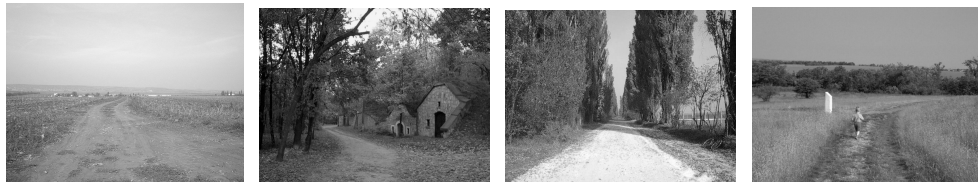
Figure 2: The most significant types of roads on the BudaVidék Greenway

Existing and potential greenway routes can be incorporated into regional planning at various levels (the National Town and Country Plan, regional plans, settlement structure plans) ( Kapovits J.; dr, Csemez A.; dr. Sallay, 2009)