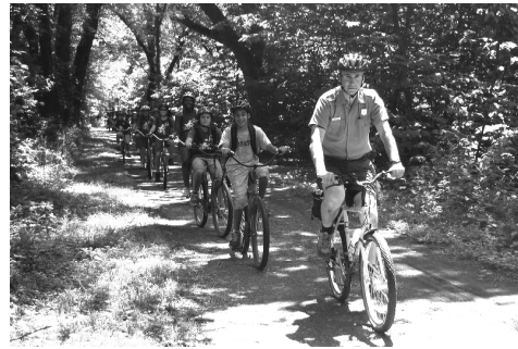
Figure 2. Bicycling along the C&O Canal as part of the Journey Through Hallowed Ground "Extreme Journey" summer experience

An example of a structured and coordinated experience along a linear corridor is the JTHG Partnership's ' Extreme Journey ' program. The program uses the themes and visitor ready sites to transform traditional textbook learning into a truly stimulating educational experience, presenting middle school students with historical situations and asking them to solve problems on their own while studying the impact through the lens of our contemporary world. ' Extreme Journey ' is a summer camp/summer learning opportunity geared towards young teens that combines a creative curriculum, the latest technology, expert accounts and on-site visits with the heritage corridor's breathtaking landscapes to create a high quality experience that would not be possible without the coordinated efforts of the Journey Through Hallowed Ground Partnership (JTHG, 2003).