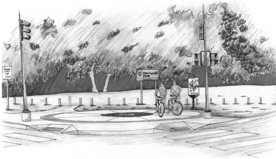
Figure 4. Gateways and Waysides along the Anacostia River Trail will have consistent design elements throughout the 48 miles of the trail system

Early meetings with the D.C. Cultural Tourism office led to the identification of interpretive opportunities along the section of the Anacostia River trail that connects to Deanwood. In fact, a portion of the trail will go along the former racetrack, making an ideal location to tell a big piece of the Deanwood Story. Other interpretive opportunities include telling the story of the Anacostia River environment and its recent history as a once forgotten and neglected landscape, home to a landfill, trash transfer station, and power plant, now being rediscovered and repaired.