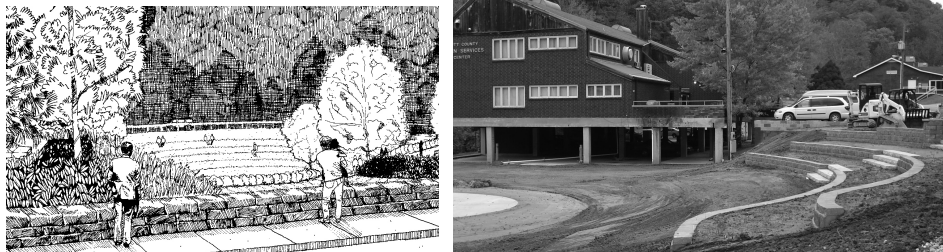
Figure 6. Early sketch on left of proposed bridge, trail and amphitheater on Troublesome Creek, amphitheater under construction, right

Time, and a well-articulated and illustrated vision ensured the completion of the final trail link – the development of an amphitheater on the banks of Troublesome Creek's branches' confluence. Today, the trail follows the creek bed between downtown and the new college buildings, with stops along the way to host 'Picken and Grinnin' bluegrass sessions at the outdoor amphitheater. The trail alignment incorporates gathering spots for respite and future interpretive panel placement and preserved, by careful trail siting, an original settler's chimney structure.