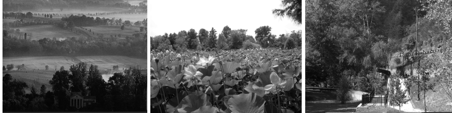
Figure 1. The Three Sites: Journey Through Hallowed Ground Corridor (left), Anacostia Riverwalk Trail (center), Hindman Community Development Initiative (right)

The three projects demonstrate differing ways to incorporate heritage tourism within linear corridor and greenway projects. By engaging the visitor's interest, a longer stay ensues, additional monies are spent, and the visitor's greenway experience is enhanced. These projects illustrate ways that a community-based planning effort can effectively link traditional greenway and corridor planning with heritage-based tourism efforts.