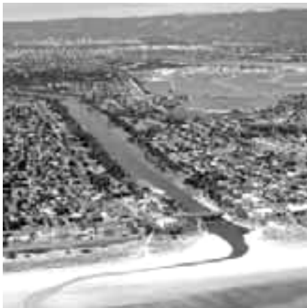
Figure 1, Breakout Creek Henley Beach South, Adelaide, SA.

In 1934 the South Australian State Government constructed a flood channel (referred to as Breakout Creek, Fig 1) on the River Torrens at Henley Beach South, to allow river flows through coastal dunes to the sea.