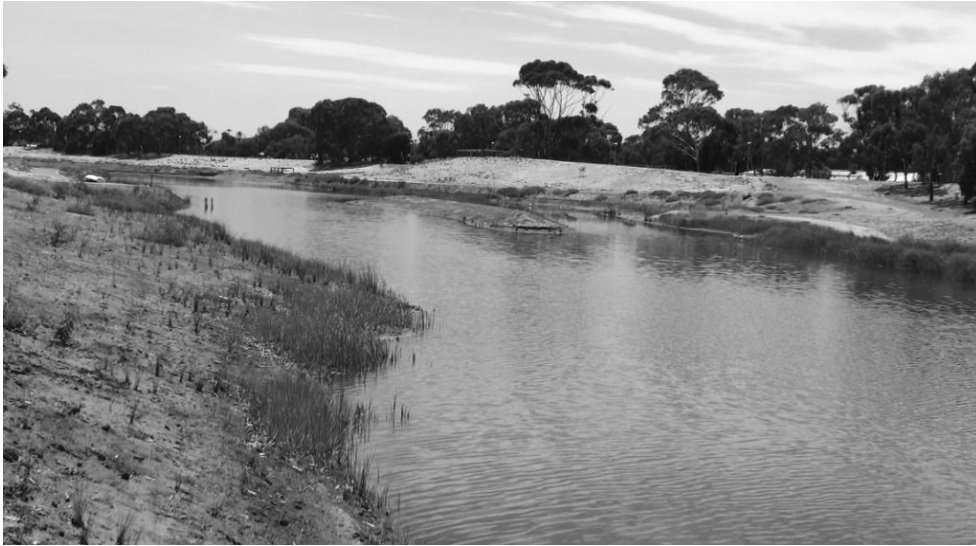
Figure 7, Breakout Creek Stage 2, downstream of Henley Beach Road.

Details observable in Figure 7 include:-