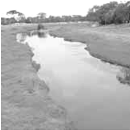
Figure 3, Breakout Creek, a constructed channel, prior to commencement of in-stream wetland project.

Prior to the flood channel, the river had no direct outlet to the sea, with water gathering in wetlands, referred to as 'The Reedbeds', which extended north and south along the coastline and several kilometers inland (Kraehenbuehl, D., 1996, Fig 2). Flood flows found their way south to an estuary, the Patawalonga, and north to the Port Adelaide River.