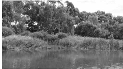
Figure 5, Breakout Creek Stage 1, Layered vegetation on bank. Taylor Cullity Lethlean.

In this paper, Breakout Creek Stage 1 and Stage 2 serve to illustrate the continuing process of realizing urban recreation opportunities, while reinstating biophysical processes in a riverine greenway.