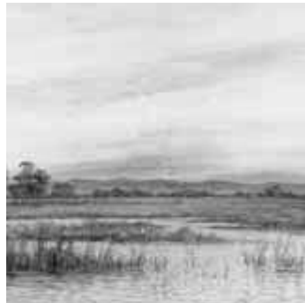
Figure 2, The Reedbeds, River Torrens, painting by James Ashton, 1890.