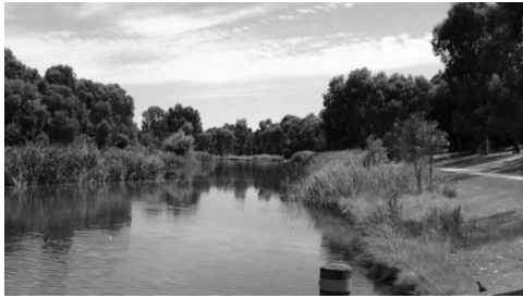
Figure 4, Breakout Creek Stage 1, view upstream. Design: Taylor Cullity Lethlean.

Stage 1 of the plan to reinstate the riverine wetlands commenced in 1998 and comprised a 500 metre stretch of the creek, upstream from Henley Beach Road, which has resolved into an environmental and community asset (Mugavin, D., 2004, p 236). Stage 1 was promoted as a demonstration project within a limited area, after a concerted campaign by equestrian enthusiasts against projected limitations on horse grazing. The value of the demonstration project prompted the adoption of Stage 2, re-instatement of in-stream wetlands downstream of Stage 1.