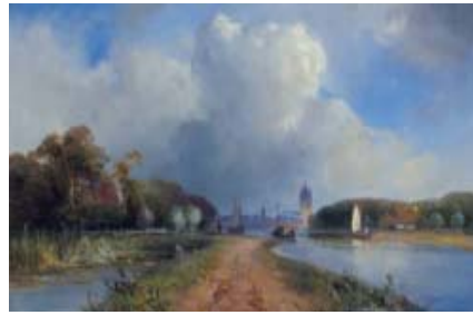
Figure 6. Johan Barthold Jongkind, View on Delft , 1844, collection of the Gemeentemuseum of the Hague

A panorama that has not changed at all in reference to the landscape on the painting, is Water mill in the polder of the Leidse Dam (1884) from Paul Gabriel (*1828 - †1903). In this painting, Gabriel depicted the last of three water mills of Stompwijk seen from the location of the second mill. The fact that Jan Hendrik Weissenbruch (*1822 - †1880) also made a painting of this scenery - this time a composition with all three mills on it - emphasizes the pictorial character of the site. Although the current view on Gabriels' landscape is unaffected, the direct surrounding of the landscape has been urbanized intensively over the last decennia.