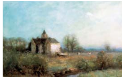
Figure 14. Louis Apol, the Binckhorst collection of the Polak art shop in the Hague

The map below gives an overview of the locations of the views on the ancient paintings.