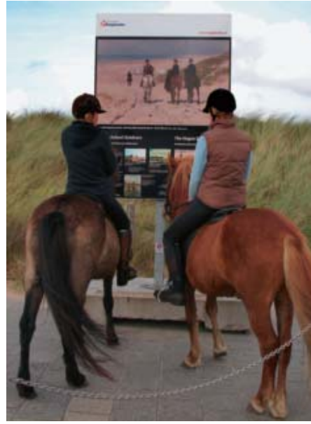
Figure 17. A billboards near De Wassenaarse Slag (photo: Gerard Metz, design bureau Zwart op Wit)

Visitors to the area would thus be made more aware of the cultural historical value of the landscape. Such signs could also give the visitor a good idea as to how the location has changed over the course of time, or even in fact how it has remained much the same. Using this strategy, which would be relatively inexpensive, 'landscape painters routes' could be created, for example in the neighbourhood of The Hague or 't Gooi. In this way the cultural connection between the city (museums) and the countryside could be marketed more visibly.