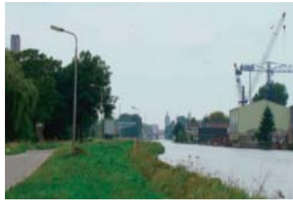
Figure 5. The current view on the site

Another painting by Jongkind is View on Delft from 1844. Jongkind painting this view also looking towards Delft and with his back to Rotterdam. The current view is being disturbed by the presence of some industrial buildings.