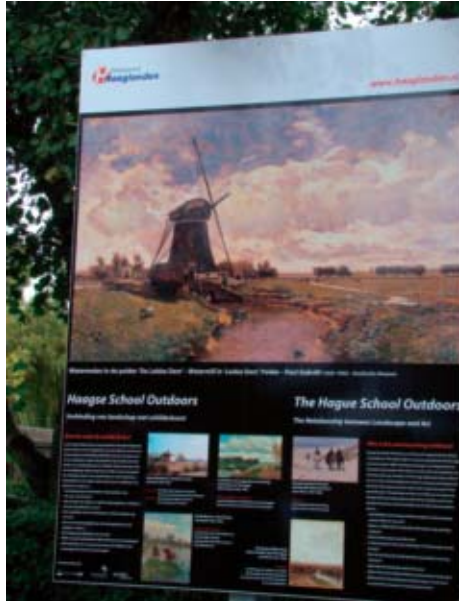
Figure 16. A billboards near Stompwijk