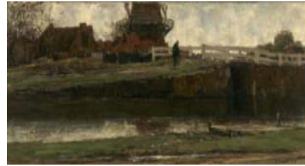
Figure 10. Jacob Maris, The cut off Mill , 1872, collection of the Rijksmuseum Amsterdam

The painting View at the Trekvliet near The Hague (1868) from Weissenbruch shows a wide landscape, with on the left the tower of the Binckhorst castle and to the right the Laak Mill (Laakmolen). Nowadays, the Bickhorst is a industrial area and the castle can only be observed from nearby, because of all the buildings that surrounds it.