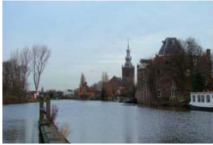
Figure 3. The current view on the site