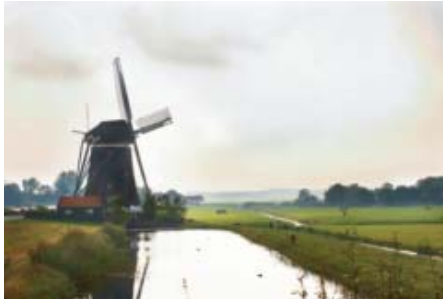
Figure 7. The current view on the site