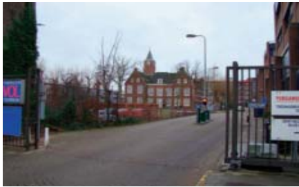
Figure 13. The current view on the site

Besides Weissenbruch, Louis Apol (*1850 - †1936) was also inspired by the view and made a painting showing a closer view at the castle.