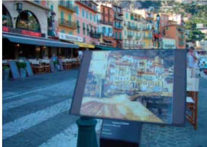
Figure 2. A billboard in the South of France depicting an impressionistic painting

rural sites have been reshaped in order bring the landscapes back to the scenery on the paintings of the great Constable. In the South of France, billboards with replicas of impressionistic paintings have been placed in the landscapes where they originally have been painted.