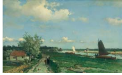
Figure 12. Jan Hendrik Weissenbruch, View at the Trekvliet near The Hague , 1868, collection of the Rijksmuseum Amsterdam

Besides Weissenbruch, Louis Apol (*1850 - †1936) was also inspired by the view and made a painting showing a closer view at the castle.