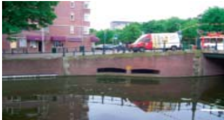
Figure 9. The current view on the site

This is for instance the case with the view Jacob Maris (*1837 - †1899) painted in 1872, showing the panorama from the painters house in those days. The current view has only the quay and the canal in common with view on the painting. Only the name of the street from where Maris painted the view - Near the western Mills - reminds at the scenery from the past.