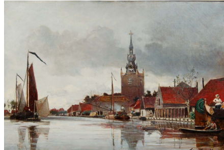
Figure 4. Johan Barthold Jongkind, The Church of Overschie , 1856, collection Museum of Duoi

Another painting by Jongkind is View on Delft from 1844. Jongkind painting this view also looking towards Delft and with his back to Rotterdam. The current view is being disturbed by the presence of some industrial buildings.