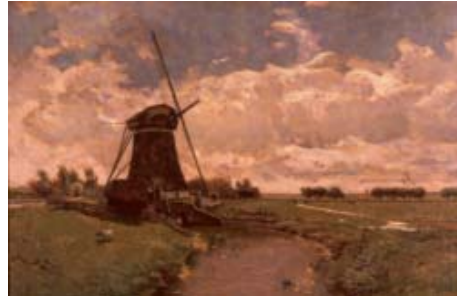
Figure 8. Paul Gabriel, Water mill in the polder of the Leidse Dam , 1884, collection the museum of Dordrecht

Besides examples of current landscapes which correspond completely or fairly well to the view on the painting, other painted rural view have nowadays been totally absorbed by urban areas.