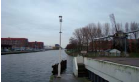
Figure 11. The current view on the site