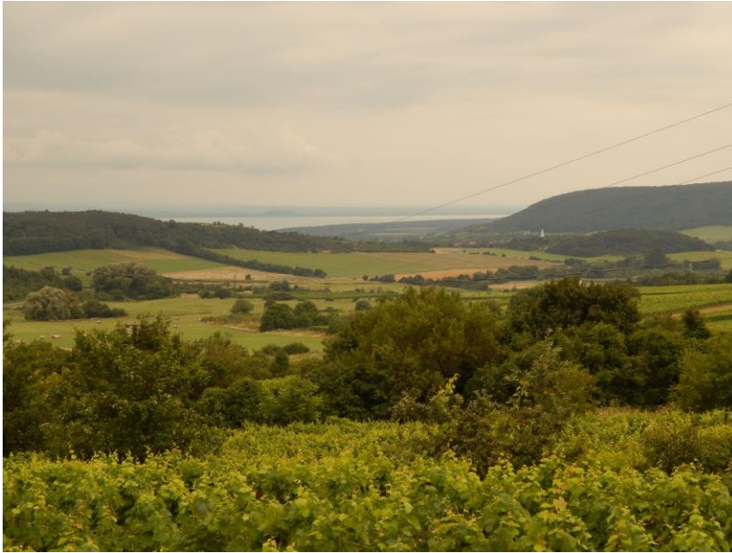
1. Figure View of the Nivegy Valley from the northern entrance to the valley

Among the limited green infrastructure elements available, the recreational, health and religious gardens or other institutional facilities in the built-up area of municipalities are well maintained. Sports fields are well maintained, but their surroundings are generally untidy and of no natural value. Only a few small estates, which occur in hilly areas, form a group of estates that are not accessible to the community (Valánszki et al., 2017).