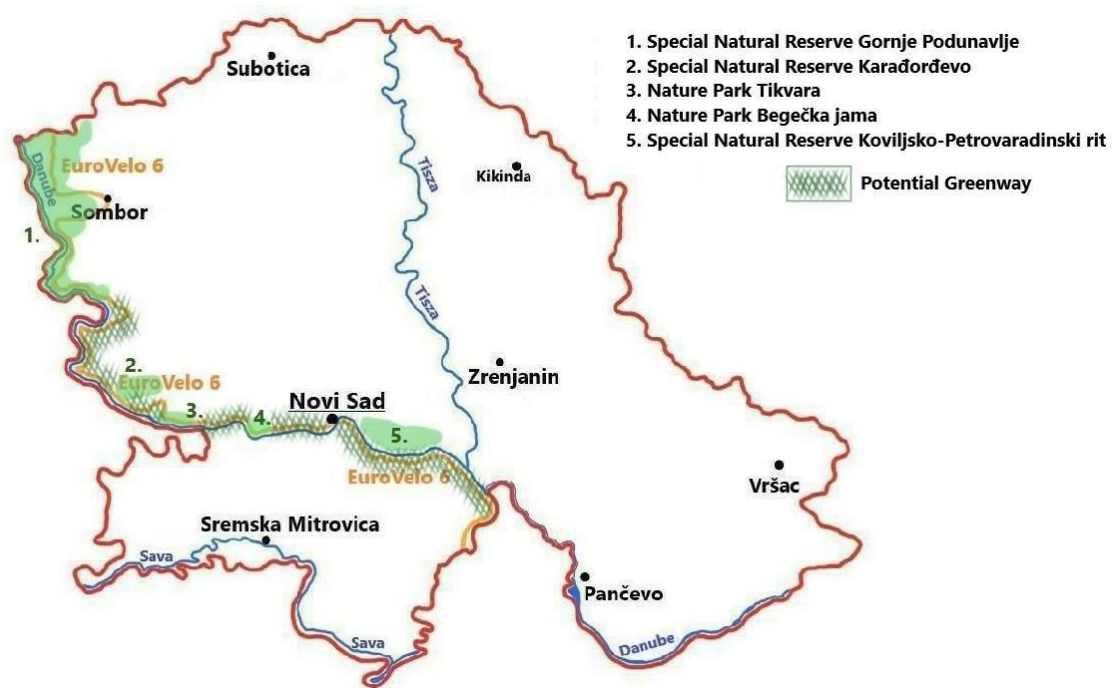
Figure 3. Potential Greenway by EuroVelo 6 route that would connect protected areas in Vojvodina Province