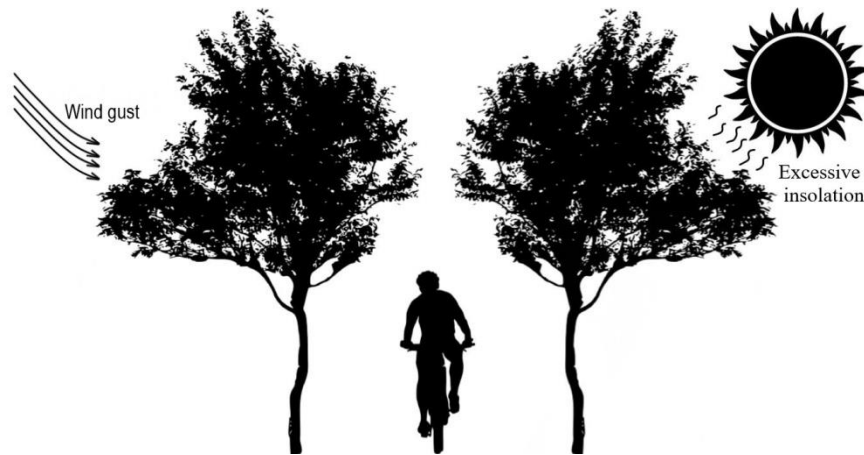
Figure 2. Schematic representation of wind gust and excessive insolation protection by Greenways

Greenway planning in Serbia is still not at a sufficiently developed level. In 2016., the first greenway in Serbia between Užice and village Vrutci is opened. The city of Užice has, in 2015-16., reconstructed the old railway bridge and asphalted the first 5 km of the narrow gauge railway route in the canyon of the Ćetinja river to Stuparska Banja, along the route of the old “Ćira Railway” which led to Sarajevo and Dubrovnik. The arrangement of the macadam route to the village Vrutci and the lake of the same name was successively extended, so that the route is now 12 km long. In 2017., The European association of Greenways awarded the city of Užice the second prize for excellence – for landscaping, content and accessibility (Pavlović et al., 2018).