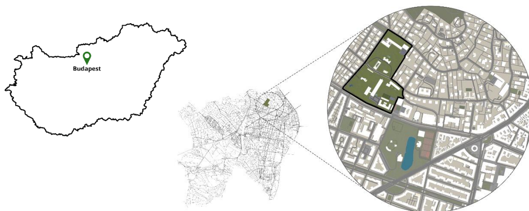
Figure 1. Location of the Buda Arboretum

The phenological phases of taxa are strongly influenced by environmental factors. The vegetation showed different responses to the extreme results of the 2021 weather data. The measures show that the winter of 2020/2021 was 2.5 C° warmer than average. The seasonal average temperature nationally was 2.4 C°, the eighth warmest winter since 1901. The seasonal rainfall total averaged 121.5 mm nationally, slightly above average (1981-2010: 111.3mm). In terms of winter precipitation distribution, January was notable as it was 19% rainier than usual (HMS1 2021). The mild winter was followed by unfavourable spring weather. According to the National Meteorological Service, spring temperatures were 1.9°C lower, the coldest spring since 1987. Temperatures rose day by day in late March and early April, but still remained below average (14.5°C). The spring precipitation total for 2021 averaged 130.3 mm on preliminary data, only slightly below the average for the last 30 years. (1991-2020: 139.4 mm) (HMS2 2021). The mean summer temperature was 22 C°, which suggests that it was one of the hottest summers in the last 120 years, in addition to long weeks with little rainfall. Outstanding in this respect was June, which was measured as the driest June in 121 years. The monthly average rainfall was only 22% of the monthly average, while July and August were 13% and 8% respectively below the previous record (HMS 3 2021).