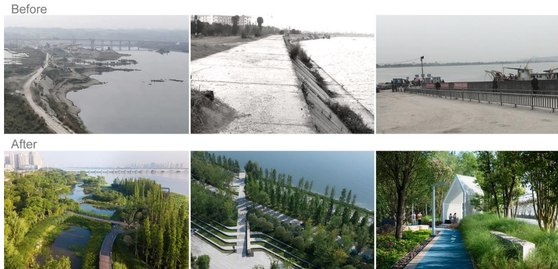
Figure 1. From an ecologically and socially lifeless shoreline belt into a verdant and sustainable riverfront park

cleansing system, recovered native habitats, and created a new cherished public space for gathering and multi-sensory enjoyment (Figure 1).