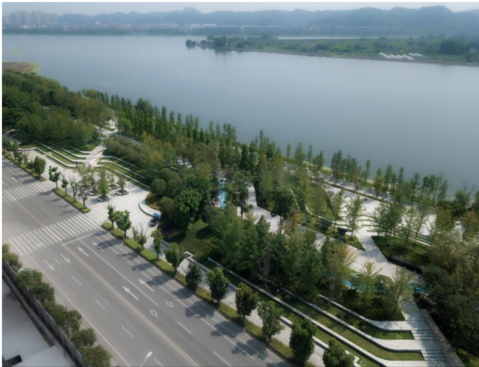
Figure 6. Riverfront Urban Fabric Engages Adjacent Communities

The portion of the park established over the bulkhead is set 2.4 meters above the street level. A series of richly planted bio-swales was created for the purposes of catching, filtering, and retaining urban runoff water on each side of the bulkhead to release cleaned water to the irrigation system and landscape water amenities. A terraced green landscape is created to catch and filter the run-off collected from the pedestrian pathways at the top of the park's topography (figure 6). The filtered water is conducted by the terraces to a lower detaining, and retaining system. Our design objective creates a purposely designed urban sponge to accomplish on-site stormwater management to control urban run-off and flash floods, solving a major challenge to modern city stormwater management.