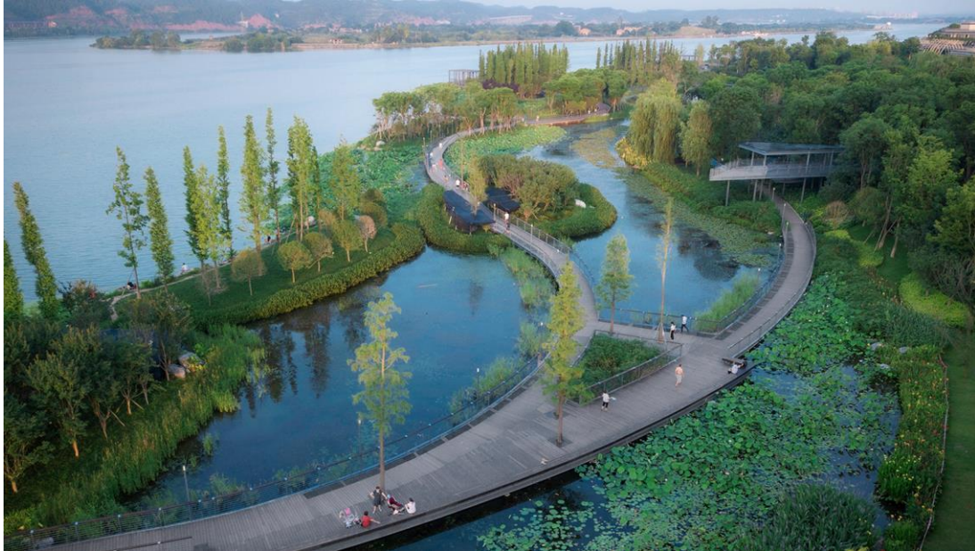
Figure 3. Resilient Riparian Wetland Lagoon System

A complex riparian wetland lagoon system, which embraces the periodical flooding cycle as a critical part of its ecological process, was set forth as the goal for the design as opposed to an ecologically meaningless "geometric line" of a concrete bulkhead (Figure3).