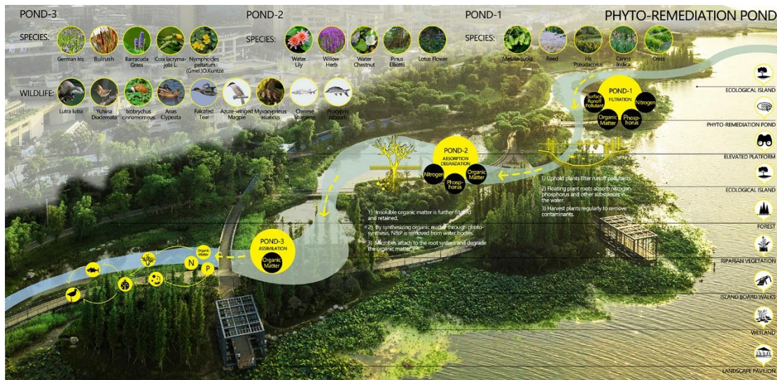
Figure 5. Functional Urban Open Space and a Phytoremediation System

The upper portion of the sculpted wetland stretch was transformed through Eco-engineering approaches that now demonstrate a vibrant living landscape, alive with water, plants, wildlife, people, and urban structures united (figure.5).