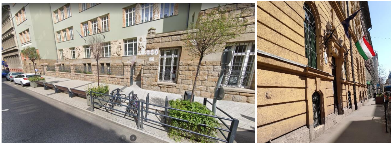
Photo 1-2: Primary school on Bajza Street and the Merse Pál Szinyei High School

In Budapest, inner city schools usually have minimal courtyards and their street frontage is not ideal. The primary school on Bajza Street opens with a miniature front garden enclosed by a fence, providing a little "breathing space" in the bustling urban jungle ( Photo 1 ). This is helped by planters along the pavement, planted with a variety of woody and herbaceous species. The planting is almost purely indicative and does not provide a serious link to the greenway network. Benches have been placed for waiting parents, but there is no barrier behind them to protect against the traffic of cars and trolleybuses on the street. This could be remedied by a thoughtful planting concept and the installation of additional planters right up to the pedestrian crossings. In the other example, the Merse Pál Szinyei High School ( Photo 2 ), both the school and the street name bear the name of the painter who spent his life admiring the landscape and plants in his garden and captured them in his paintings (Szinyei, 1990). His landscape impressions are not visible either at the entrance to the school or in the schoolyard. In its present state, the school does not keep pace with the painter's