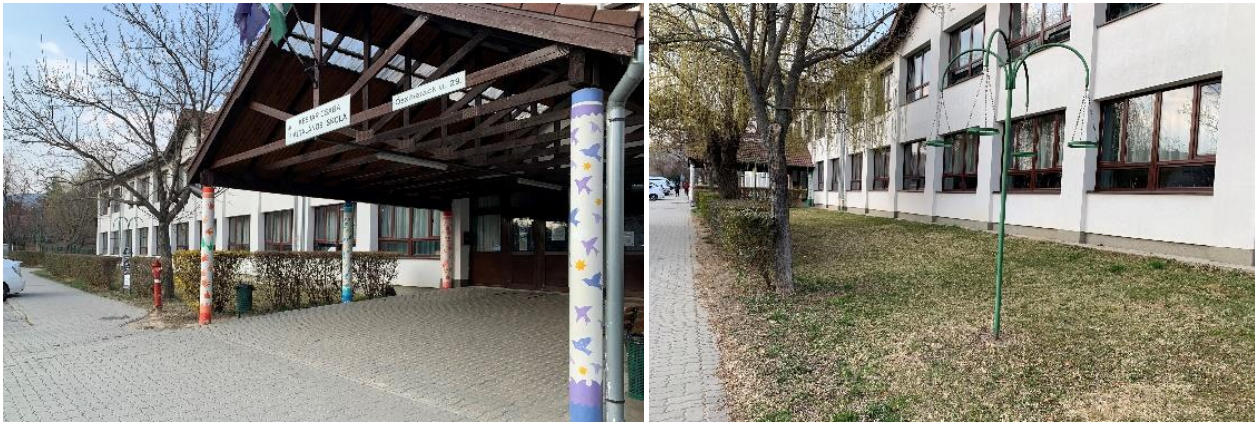
Photo 3-4: Entrance zone of the Csaba Kesjár Primary School in Budaörs

currents, lack of identity. The narrowness of the street means that a serious green street cannot be expected, but the creation of a green environment could begin in character, even with planting, as the initiatives at the entrance to the primary school on Bajza Street show. Planting pots could not only create a more natural environment, but also a more sheltered situation, which would be an important incentive for young people attending school. In addition, after analysing the site, innovative planting concepts could be developed to create a green environment.