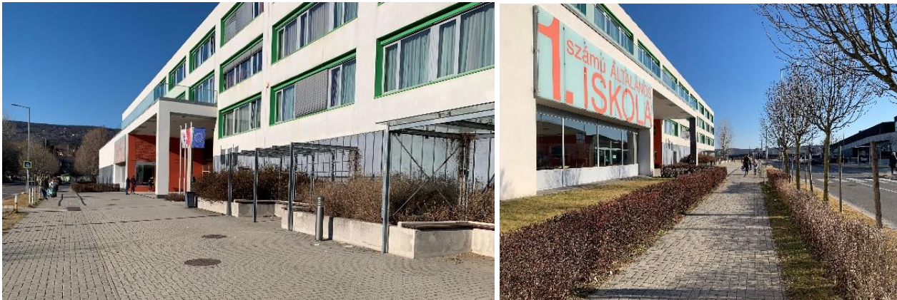
Photo 5-6: Entrance zone and public spaces around the Budaörs No.1. Primary School

In the case of schools in suburban and agglomeration settlements in Hungary, we typically encounter larger courtyards and green spaces. Entrance positions are also more sheltered, connecting with streets with less traffic and making it easier to create green spaces. In the case of the Csaba Kesjár Primary School in Budaörs ( Photo 3-4 ), a small space is created directly in front of the entrance, but it is not suitable for longer stays due to the lack of seating. The green strip between the building and the sidewalk consists of low hedges, lawns, and a loose, mixed row of trees. Budaörs No.1. Primary School ( Photo 5-6 ), less than 500 meters away, is of a later design and its relationship with the public space is similar in many respects. There is a sidewalk and a green lane between the moderately busy street and the building. To the north of the entrance, there is a lawn strip with hedges and a row of trees, but to the south of the entrance, adjacent to the