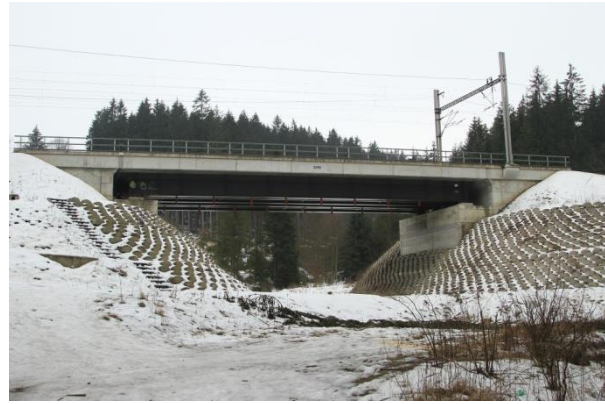
Figure 4. Railway bridge near Mosty u Jablunkova. Originally a small culvert enlarged into a passage suitable for all animal species during the modernisation