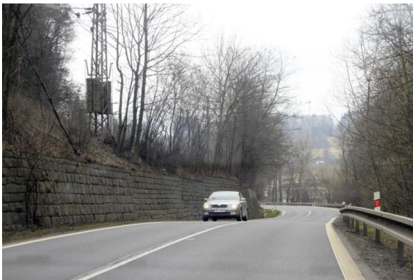
Figure 5. I/57 road in the model site Brňov. The retaining wall in combination with the railway line forms an absolutely impassable barrier.