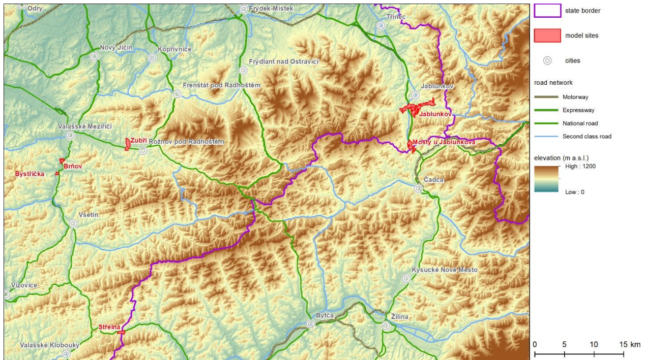
Figure 1. Study area and six model sites

Total of six model sites (figure 1) within Beskydy mountains were chosen among critical sections identified within Habitat of selected specially protected species of large mammals, the proposed ecological network to ensure the landscape connectivity for wildlife in the Czech Republic (Romportl et al. 2017). A common feature of these sites is the presence of multiple types of barriers that threaten connectivity, including railways, non-forest areas, arable land, and development in addition to roads.