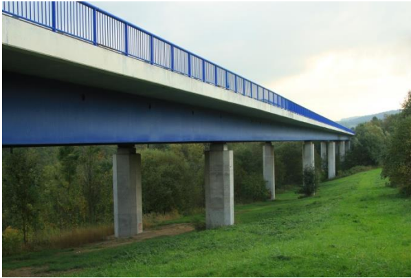
Figure 3. Site Jablunkov, bridge nr. 11-193. The crossing of the migration corridor at Jablunkov through the I/11 road is secured by a 440 m long flyover bridge.

The evaluation of objects usable as potential passages for large and medium-sized animals resulted in the discovery that suitable structures are located only on the relatively newly built I/11 road near Jablunkov and the railway line there (Figure 3,4,6). The other older roads, despite high traffic intensity, do not have suitable structures, on the contrary, the permeability is degraded by the structural-technical layout of the road, e.g. in the form of a retaining wall (Figure 5).