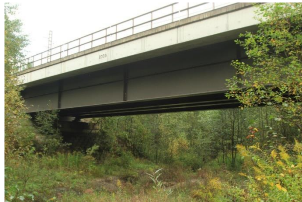
Figure 6. Railway bridge in Jablunkov. Another example of a structure adapted to wildlife migration during railway reconstruction