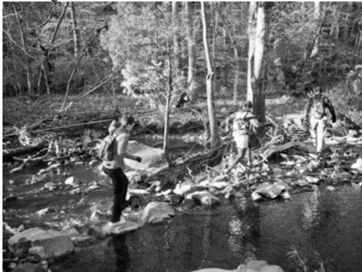
Figure 4 – Rivanna River Trails seek to preserve a rustic trail experience within walking distance of City neighborhoods and the University of Virginia

Rivanna Trails Foundation's original "greenbelt" evolved to a "loop" which helped the community visualize the benefit of a continuous trail system. The Carolina Thread Trail used the imagery of the rich textile heritage of the region to help their region visualize how such a trail system and communities can be woven like whole cloth. The D&L Canal created a visual and graphic identity early on in the process to help their regional partners and visitors see and understand resources differently. Each strong vision helped these regions establish strong financial, organizational and volunteer partnerships to achieve a common regional goal. Organized into management entities that have helped gain national and regional recognition and awareness of important natural and cultural resources, the entities have also raised and distributed funds for project implementation and drawn together volunteers to work on pieces of larger and more ambitious goals.