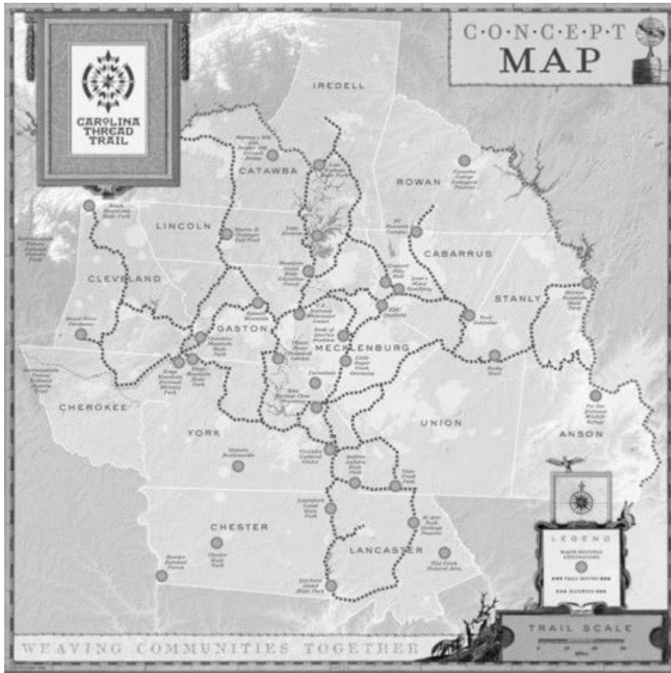
Figure 1 –Weaving Communities Together (Carolina Thread Trail)

especially prescient as it brought together the twin towers of preserving open space and providing access to that nature that was to be preserved. Initiated in 2007, five plus years later it has established a system of 113 miles of trails with a number of new projects in the planning stages. Covering fifteen counties in two states, it has involved urban, rural and suburban constituents in a unified vision. A mixture of public, private and nonprofit supporters have coalesced to fund and encourage its efforts, including private foundations and corporations. (Duke Energy and others).