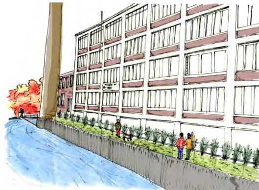
FIGURE 3: EXAMPLE PROPOSED BY GELLER OF A RIVER WALK ACCESSIBLE TO THE PUBLIC.