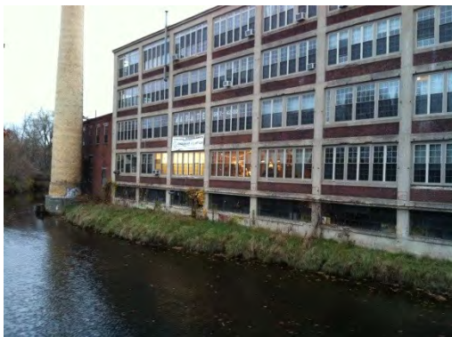
FIGURE 23: INACCESSIBLE AND UNUSED PORTION OF THE ARTS AND INDUSTRY SITE ABUTTING THE RIVER.

Sophia Geller (class of 2013) in the Landscape Studies department at Smith College, addressed the same site for a project in a broad-scale design and planning studio in the fall of 2012. After assessing the ecological, physical and cultural realities and potentials of the site, she created a series of bylaws which would promote ecologically responsible storm water management and public access to the riverfront. Her proposed bylaws offered increased opportunity for mixed-use development and the building of new structures in exchange for publicly accessible recreational spaces directly abutting the river, while simultaneously catching and filtering storm water runoff and decreasing the total amount of impervious surface on the property. Geller’s design concepts allow people to re-engage with the historic Mill River through entry points to experience more thoroughly the landscapes of their towns.