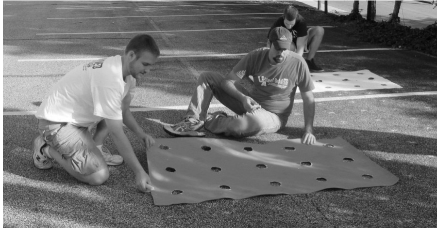
Figure 1. A template for the 1' grid of dots speeded the marking process by eliminating the need for measuring.

We initially planned to mark a large part of the parking lot with a one foot grid of two inch round dots of blue to represent the water (Fig. 1). After several hours of general application of the blue dots, we to focused on the smallest of our three watersheds. This one ran down steeply into a loading dock area and was perfect for a demonstration of the potential of the watershed to clear water from the lot.