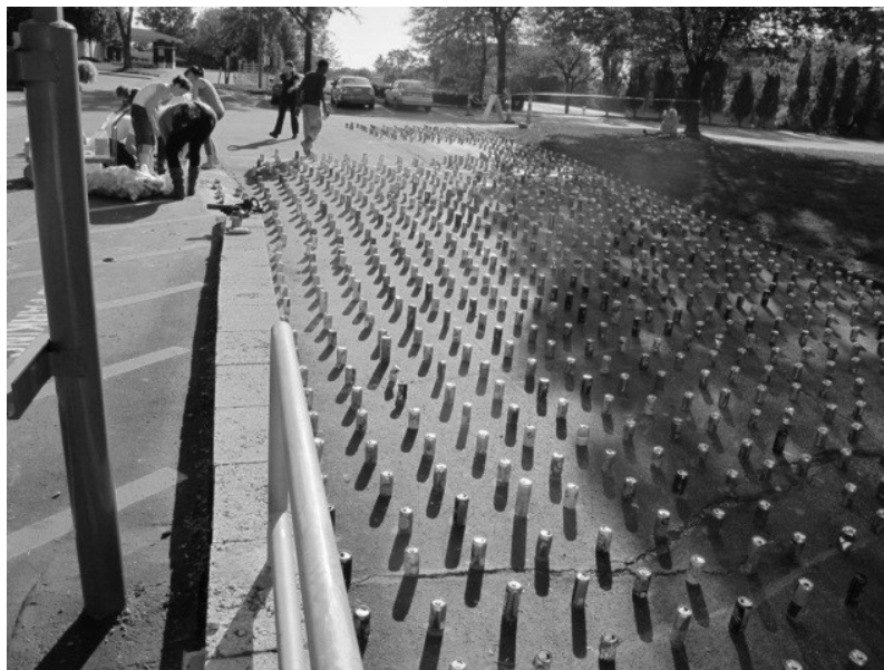
Figure 2. Recycled 12 ounce cans were filled with water and placed on top of the 1' grid of blue dots. Twelve ounces per square foot represent approximately 1/6" of rain.

The Environmental Akron members had obtained a very large supply of empty 12oz soda cans. We placed them on a one foot grid within our smallest water shed, after filling them with water (Fig. 2).