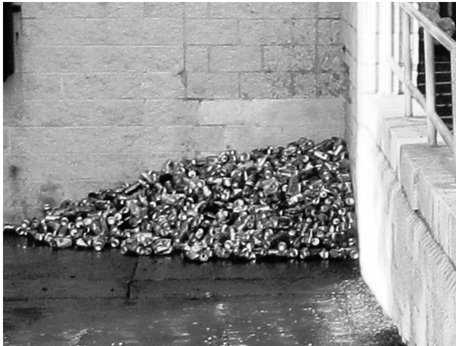
Figure 6. The volume of cans was the lasting visible evidence of the volume of water shed.

This project can be perceived as a teaching module or an environmental art project. As the former, it provided a quantitative demonstration (Fig. 6) of a process that occurs at much larger scales throughout our landscape. As the latter, it gained a larger and receptive audience. The paint lasted for nearly two weeks in the parking lot and, therefore, could continue to generate discussion after the event was over. It serves as an example of the spatial thinking that must be applied to landscape problems as well as a small step towards making this kind of thinking more accessible to the general population.