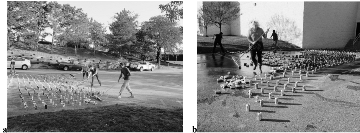
Figure 3 a & b. The shedding of water was accomplished by volunteers sweeping the cans downhill with janitorial brooms.

Once the stage was set, students with wide brooms began the sweep of cans towards the storm sewer (Figure 3). We documented the set-up, beginning, and process. The water first drained in small streams from top towards the storm sewer (Fig. 4a), but it soon changed to a broad sheet flow that constricted towards the storm drain (Fig. 4b). The roar of the water filled cans provided one of the most dramatic aspects of the event. The sound seemed very like an icebreaker pressing forward thru icy water. It was exhilarating.