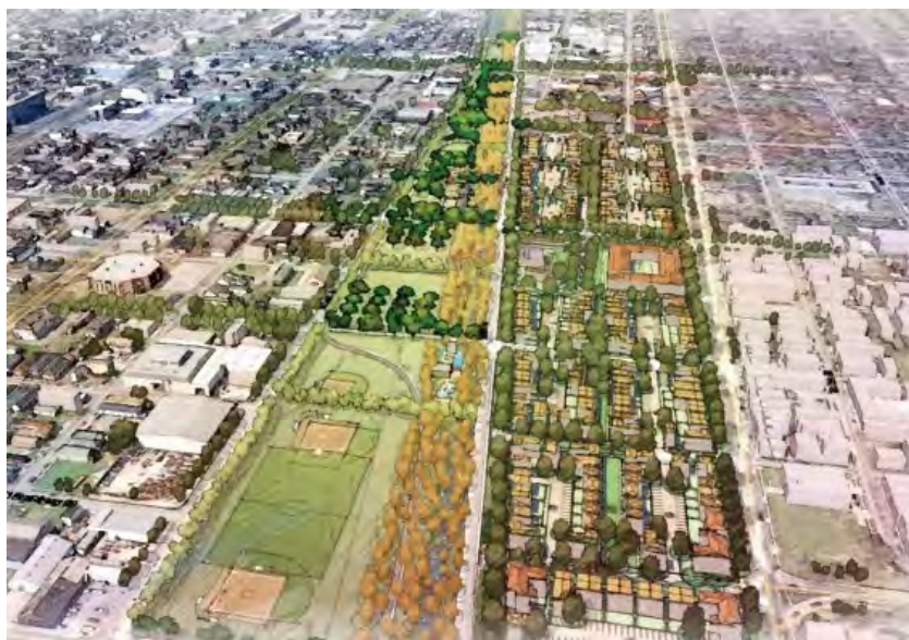
The final greenway design created a balance of recreation, trail space, and storm water management.

Demonstrating that improvements in the study area are a direct result of the creation of the Lafitte Greenway will be difficult, but the process employed at least documents the baseline conditions at a critical time in post-Katrina New Orleans.