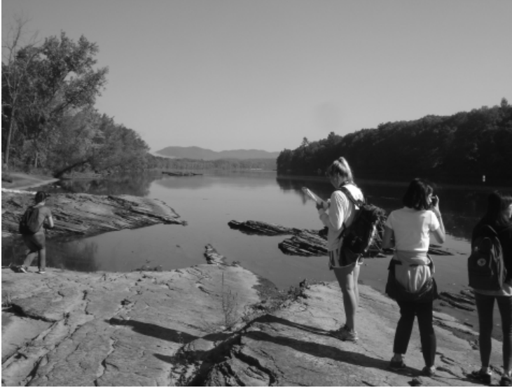
Figure 4. Connecticut River and Mt. Holyoke Range with rock formations that include dinosaur tracks and other fossil traces