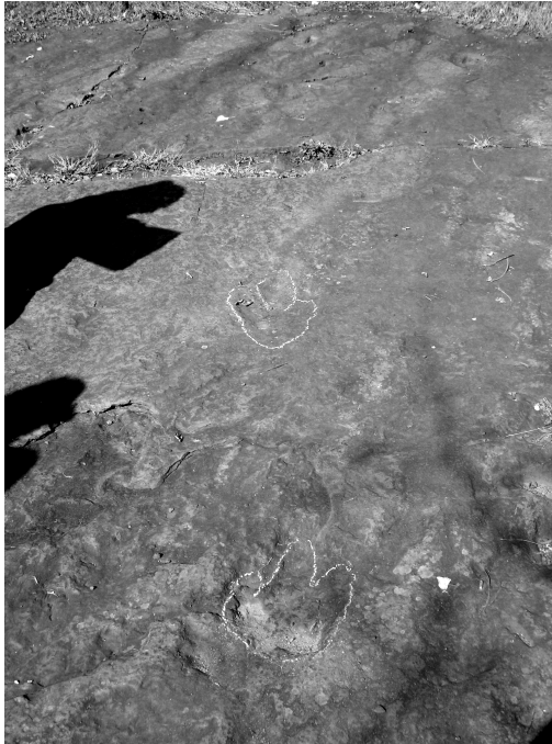
Figure 5. Dinosaur tracks outlined in chalk at Trustees of Reservations site, Holyoke, MA