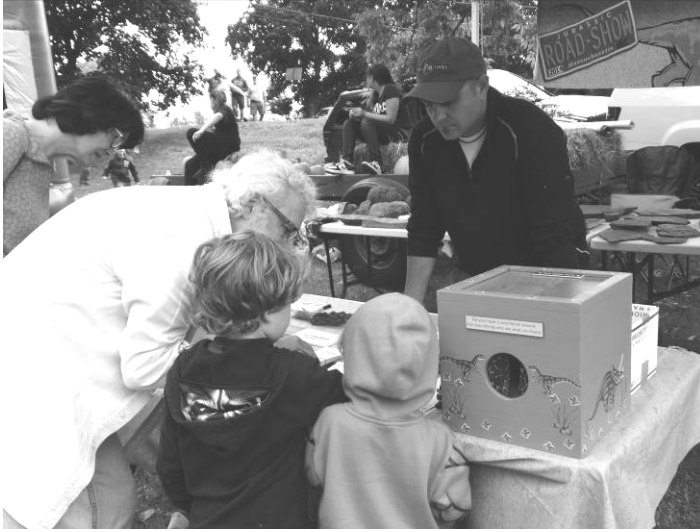
Figure 3. Jurassic Road Show booth at Dinosaur Days Festival, Granby, MA

Long distance trails exist in the region including the 215 mile long New England Scenic Trail that runs along the forested hillsides, including the Mt. Holyoke and Mt. Tom Range ( www.newenglandtrail.org ). The Farmington Canal trail follows the route of a historic canal from New Haven, CT to Northampton, MA. The new canal park in S. Hadley, MA became an important node on the dinosaur trail, as it provided one of the few sites to see the canal remains. The Connecticut River Paddler's Trail, an existing blueway trail for canoers and kayakers was used to connect sites along the river ( www.connecticutriverpaddlerstrail.org ). Spur trails were then developed to these access points, such as Barton Cove in Gill, MA which has a historic dinosaur track quarry from the 1800's, as well as the Dinosaur Tracks site owned by the Trustees of Reservations (Fig. 4 and 5). Scenic byways such as the Franklin County scenic farm byway through the region's historic agricultural areas also provided the framework for driving tours.