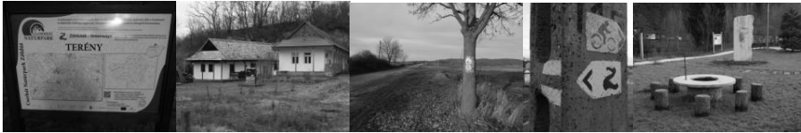
Figure 6. Pictures from Cserhát greenway