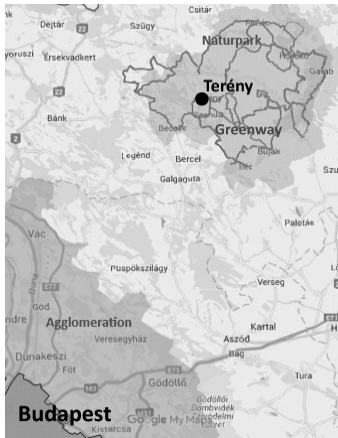
Figure 2. Cserhát greenway (on the basis of map from http://zoldut.cserhatnaturpark.hu/terkep.php )

The data from the chosen region show clearly the processes of urbanization and agglomeration. The Budapest agglomeration includes 81 settlements, which are included in the Landuse Framework Plan for the Budapest agglomeration first approved in 2005 then modified in 2011 (terport.hu).