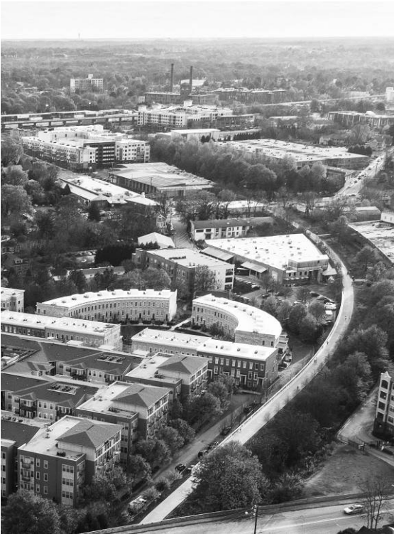
Figure 5. Atlanta BeltLine Eastside Trail

Among the many community engagement initiatives contributing to the project’s phenomenal grassroots support is “Art on the Atlanta BeltLine.” Now in its fourth year, this is the largest temporary public art installation in Atlanta’s history, and it draws thousands of people into the corridor. The intent of the program is not only to make the Atlanta BeltLine a space for the arts but also to realize its value as a public space.