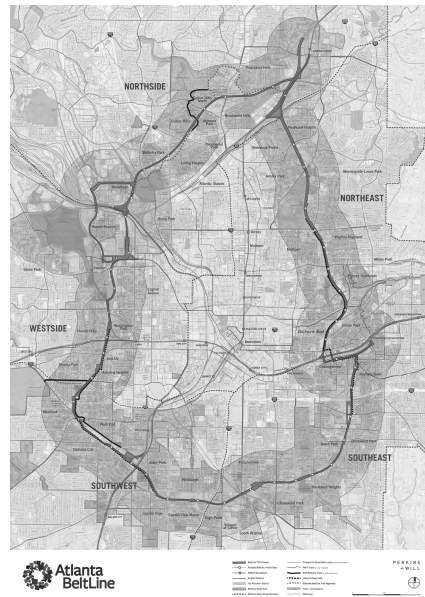
Figure 1. The Atlanta BeltLine – Overall Map

21 st Century urban promenade, or Chicago's Bloomingdale Trail, an elevated multi-use trail and park (Sinha, 2013), the Atlanta BeltLine Corridor will consist of both a multi-use trail and light-rail transit, capitalizing on the social and environmental benefits of a linear open space system and the economic benefits of Transit-Oriented Development (TOD).