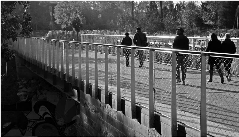
Figure 4. Eastside Trail Bridge with Elberton Granite and Stainless Steel Railing

This family of materials meets its fullest expression in the transit stations and platforms, where granite pavement meets steel structures finished in black anodized aluminum. The ceilings of the shelters are finished in wood, adding a critical sense of warmth, as are the benches and other seating arrangements on the platforms. The railings, fences and signage all rely on the same palette of stainless steel, anodized aluminum, and corten steel.