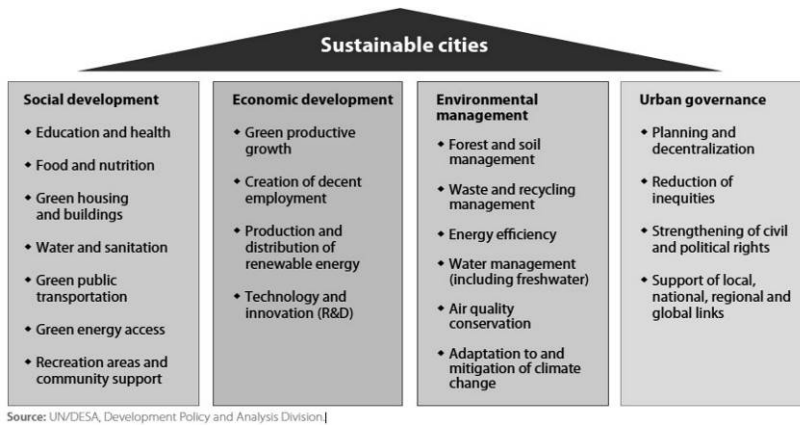
Figure 2. Pillars for Achieving Sustainability of Cities (UN, 2013, p. 62)

That both smart energy and greenways can play vital roles in achieving sustainable urban form will not surprise those of us who strive in various ways to create cities of the future, but merely including both in broader planning processes does not mean that they can be combined into synergistic relationships that contribute uniquely to achieving the goals of sustainability. There are several such relationships involving contributions that the two sides of this equation—smart energy and greenways—can make to one another as well as to sustainable and resilient urban form.