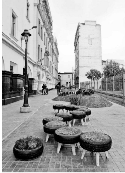
Figure 4. “Invasion Verde” in Lima