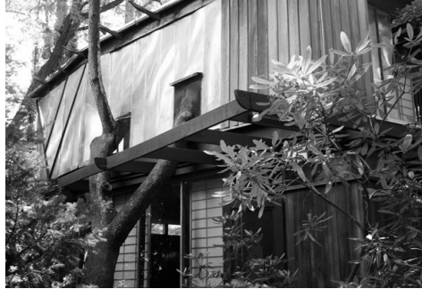
Figure 2. Ridgewood Residence, tree growing through house