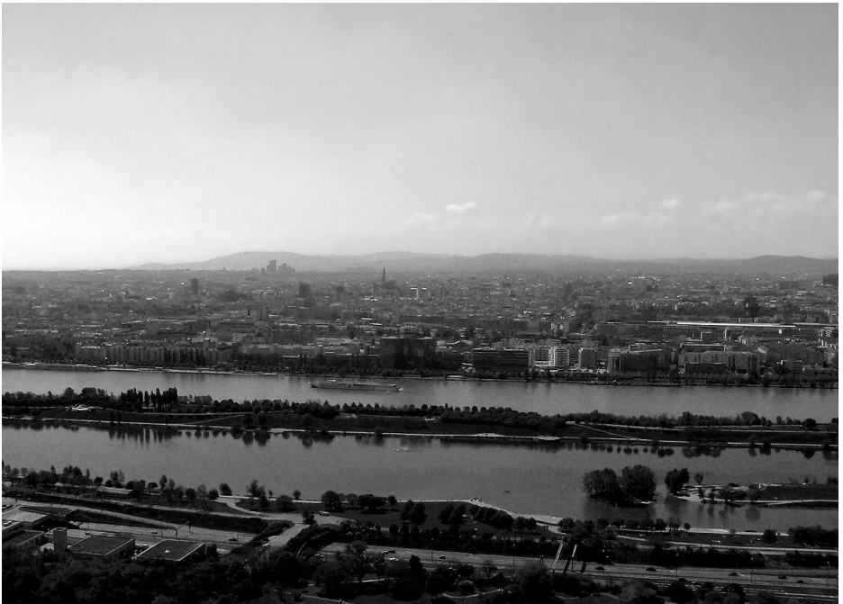
Figure 3. The Danube Island situated between the New Danube in the foreground and the main stream in the background (author Marco Aldeia)

accessibility to the waterfront and the water and facilitates various outdoor activities. These urban spaces with their different aesthetic, functional, and formal characteristics are essential for multiple use and site identities. The standard of urban ecology has improved, not only in extensively managed parts of the urban landscape but also in the intensively used zones of these landscapes, and by connecting the island and the channel to the larger system of the river. Thus, even a newly constructed landscape can upgrade an existing greenway and become an integral part of the urban green and blue infrastructure. The interactive planning process of the “Vienna Model” has already proved to be an appropriate tool to mediate these challenges and can be adapted for further urban projects.