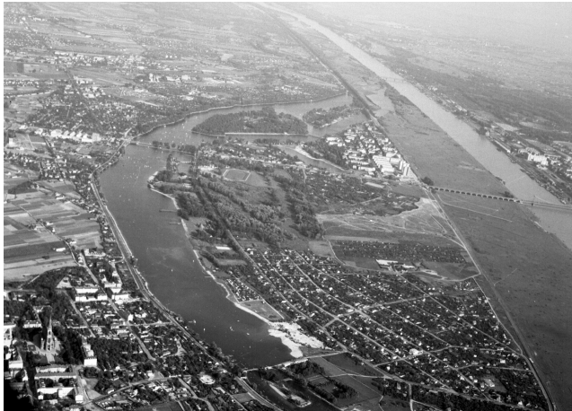
Figure 1. Urban Danube network in 1960: cut-off Old Danube (left), inundation area and Danube River (right)

The Danube Island in its existing form and function is the result of a planning process lasting twenty years. Internal and external factors have influenced this process and shifted the project's focus, transforming it from a purely technical structure into a multifunctional greenway. From the 1880s up to the 1950s, urban planning ideas and projects aimed at bringing the built structure of the city closer to the Danube and initiated rapid urban expansion on the right bank of the former flood plains, while the left bank was transformed into a 450-meter-wide inundation area (fig. 1). The huge potential of the Danube area as a multifunctional greenway was not a primary consideration.