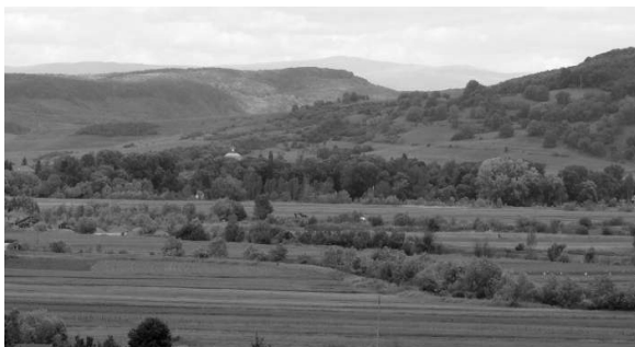
Figure 3. The view of the Teleki Castle garden from Gernyeszeg looking from the Teleki crypt from Sáromberke (approx. 2 km). The dome of the castle is rising over the green mass of the castle's park vegetation

5. The landscape connected to the main river valley trough along the left side branches of the Maros river is characterised by highland agriculture, based on the duality of forestry and animal husbandry. As a result of several centuries of development, it also bears the marks of the various colonization periods, people of diverse social, possessory and economic situations, as well as that of the different agricultural technologies.