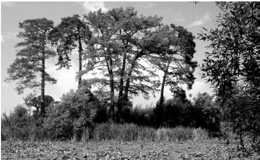
Figure 4. Coniferous group (Pinus sylvestris and Taxodium distichum) in the landscape garden in Abafája/Apalina

7. Due to the large number of significant exotic woody plants, frequently planted in mass, some of the surveyed castle gardens (Abafája/Apalina, Gernyeszeg/Gornesti, Görgényszentimre/Gurghiu, Sáromberke/Dumbravioara) present dendrological garden characteristics, having remotely striking appearances. By the means of their visual connections still present, they enrich the landscape of the Maros river valley, appearing as spots or characteristic elements and represent a serious value to landscape aesthetics. (Figure 4)