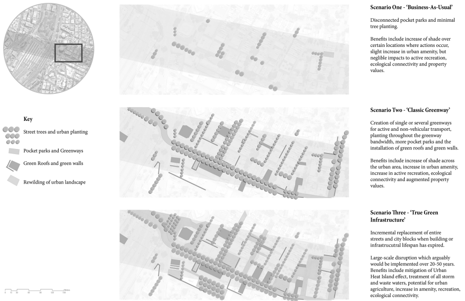
Figure 3. Three design scenarios explored across detailed study area