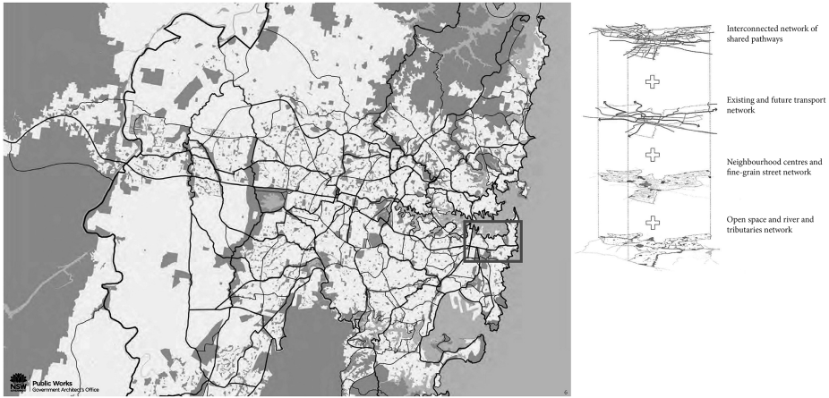
Figure 1. The Sydney Green Grid and its design genesis