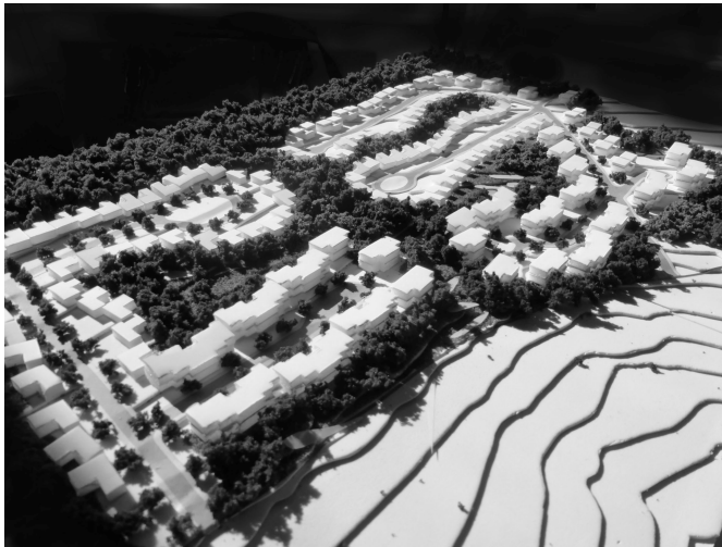
Figure 2. Cactus Green park Model

Cactus Green Park will occupy 13 hectares of farmland with 6-8% gradients. A vestige of forest is located on the ridge immediately above the site, and to the south is a green valley floor containing agriculture and marshland. Our concept was to link these two biomes with a continuous productive urban landscape - combining sustainable drainage, peri-urban food, and soil conservation - and a series of pocket parks, to maximise park frontage.