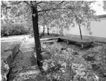
Figure 1. Detention area. Possible to collect a big amount of stormwater runoff

planners, engineers and landscape architects. The need to understand the flow of water in every case study, forced us to find a way of showing it, as shown in the example from Bjerkedalen Park reopening project in Hovinbekken (fig. 2)