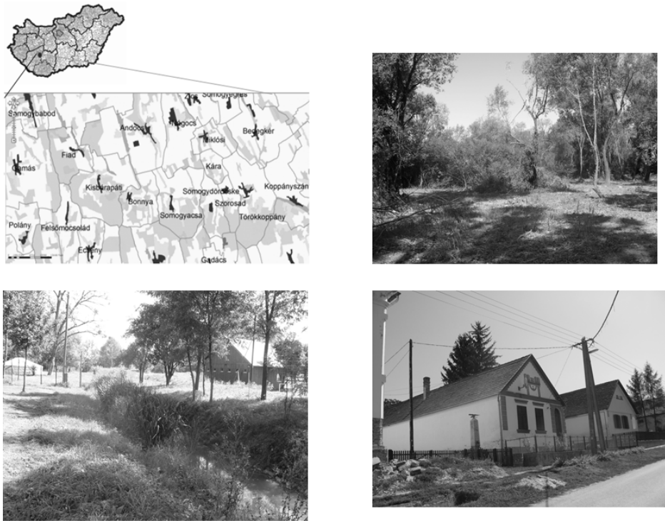
Figure 1. The pilot region; a, Situation of Koppány-valley in Hungary, b, Wilderness along the creek, c, Creek Koppány in Törökkoppány, d, Architectural values of Törökkoppány

We carried out a complex analysis revealing the natural, social and economic characteristics of Koppány-valley consisting 10 settlements focusing on three pilot areas along the creek: Törökkoppány, Karád, Somogyacsa.