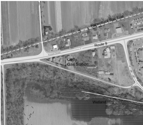
Figure 1. Site Located between the Norwottuck Trail and Connecticut River Wetland