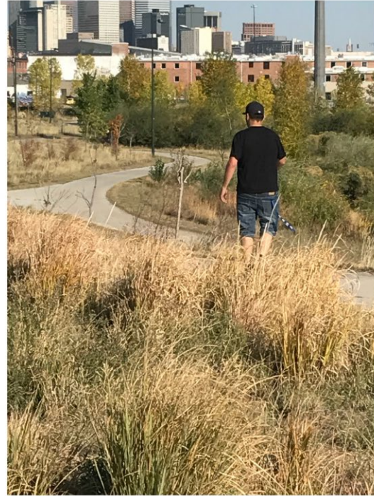
Figure 2. Views of the Lakewood Gulch Trail looking west (on right) and east toward Downtown

When neighborhoods of different socioeconomic status are connected through greenway trails, concerns over issues such as crime are often raised. Studies have shown, however, that such fears are unwarranted. Often not considered, however, are potential negative effects on low SES communities when an “amenity” is placed in their midst. Greenway planners need a process for taking into account the concerns of low SES communities about environmental gentrification. They also need a process for building a greenway user base within the low SES community so that the positive mental and physical health benefits of greenways, as well as the economic benefits, can accrue to urban residents who most need these amenities.