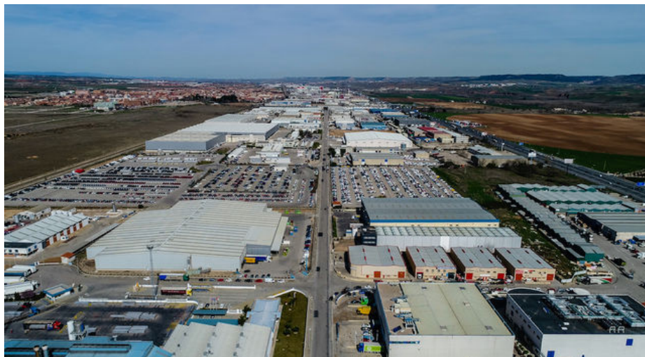
Figure 5. The Corridor del Henares in the municipality of Azuqueca de H.

The grey-line, like the great industrial development, is recognized with the paradigm of the 'Industrial Corridor': a strip of about 50 km closed between the connecting infrastructures that host the largest industries in the area and the establishments linked to the logistics of the Barajas International Airport and Madrid surroundings. With the creation of the Corridoio del Henares between the 1950s and the 1960s and the advent of industry, the city had a residential development tripling its surface area and population. It has occupied all the compressed agricultural spaces between the walls and the river.