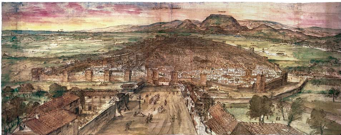
Figure 3. Drawing of Alcalá de Henares made in the year 1565 by the Flemish painter Anton van der Wyngaerde, known in Spain as Antonio de las Viñas

In 1499 Cardinal Cisneros founded the first Renaissance, humanist and universal university within a block of the historic city which today is called Manzana Cisneriana and which is the reason for the recognition of the city as a UNESCO World Heritage Site. His position was clear and the relationship with the river was narrow and interdependent. We can find in the words of the Mayor of Alcalá de Henares in 2001 a clear recognition of the preservation of the environment like hardware for a circular economy: