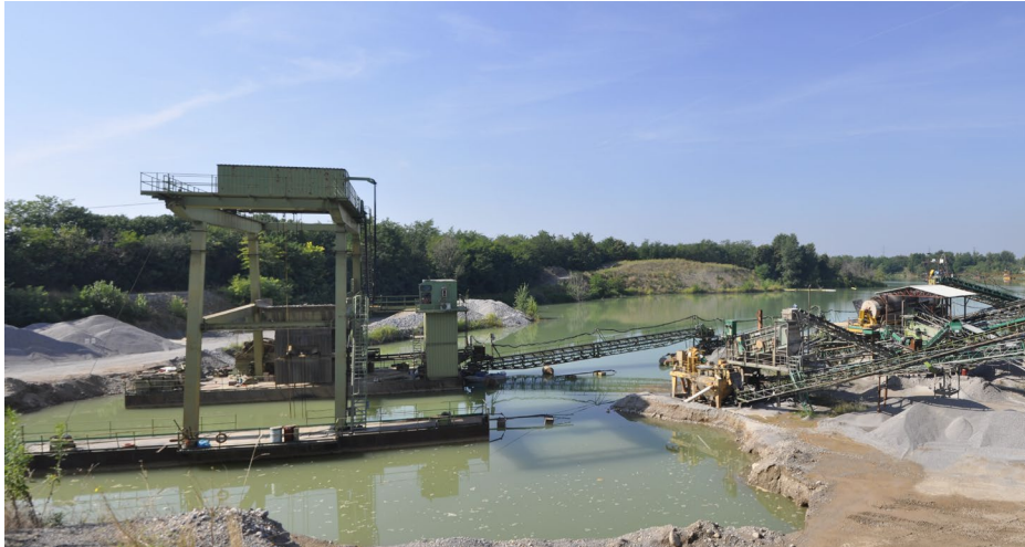
Figure 7. Steel Giant. Memory of the Quarries activity

The quarry lakes, due to their peculiar nature, being aquifer basins made up of groundwater and inert materials, are perfectly compatible with the natural-recreational development of areas with a parked vocation. It is desirable to omit this discussion of the conversion of these areas to storage of inertia, dumps or areas of transformation. The conversion potential of these areas, excluding the option of restoring ancient fields, is 100%. In this portion of Brescia territory, following careful inspections, it was found that there are no pollutants in the soil or in the waters. These analyses first and foremost confirmed the