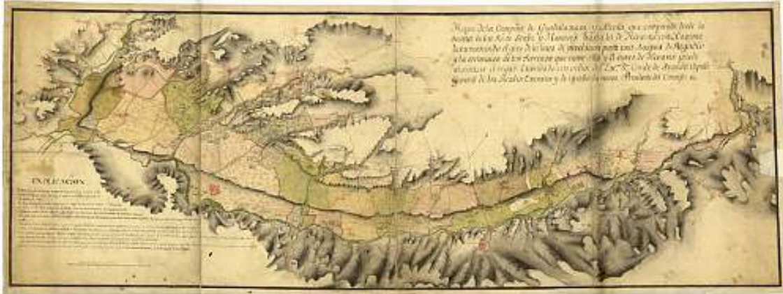
Figure 2. Valle del Henares, del Sorbe al Jarama, año de 1770