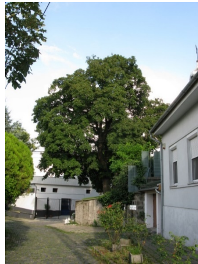
Picture 7. A tree dominating a narrow street

Also, large size in itself is not sufficient to gain significance. The difference in the number of potentially significant trees in Phases 1 and 2 shows that a number of trees of outstanding size proved not to have a major effect on local image. Reasons include being hidden behind objects or other trees from public viewpoints and blending into their surroundings without dominating the scenery. As the research described above is prone to a certain level of subjectivity, further study is necessary to solidify findings and pinpoint key factors.