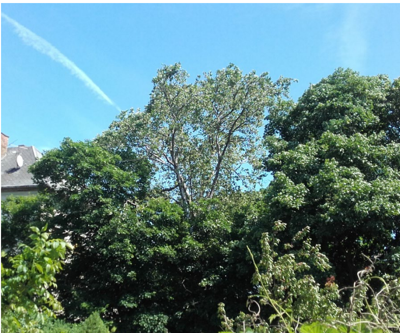
Picture 1. A large white poplar being blocked from view by other trees, excluded in Step 2.

In addition to assessing pre-selected individuals, surveyors are also required to visit every part of the study area in search of trees which are prominent but had not been marked in Phase 1. If such trees are encountered, a unique identifier is assigned to them and the detailed survey process is carried out. New additions in Phase 2 are typically relatively small in size, but due to their appearance or location, they are still a dominant feature of the cityscape (Picture 2). As Phase 2 involves crucial decision-making, the preparation of surveyors is key. Each pair must be equipped with the same set of evaluation criteria to minimize differences between pairs. During phase 2 of the project in District XXII., 1.100 individual trees were marked as significant on-site.