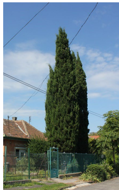
Picture 2. A small but striking cypress, a new inclusion in Step 2.