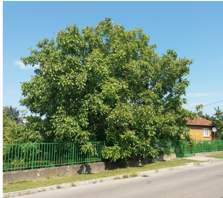
Picture 9. Relatively small trees also can be significant in more rural areas