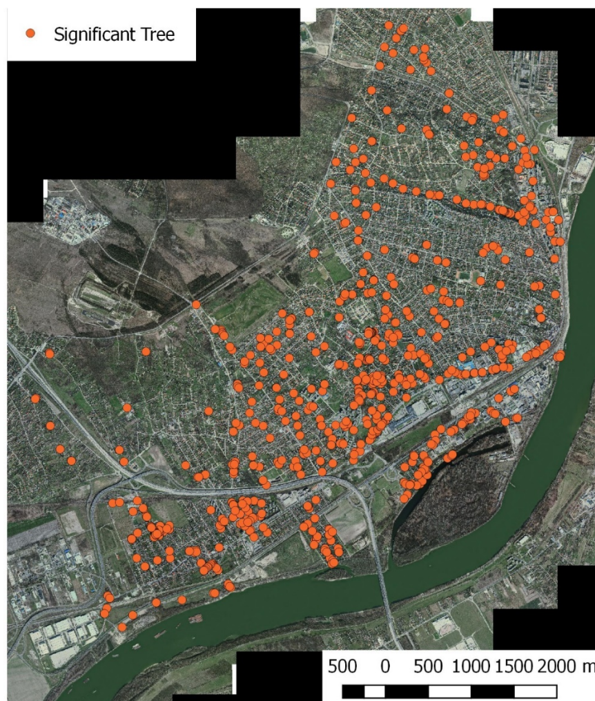
Picture 3. Location of the 706 Significant Trees of District XXII.

The second purpose of Phase 3 is to correct mistakes and discrepancies made by surveyors – incorrect identification, varying word usage etc. can be identified and corrected during this phase. In the case of District XXII., as the municipality expected the top 1% of its tree stock, a total of 706 trees were ultimately included in the list of Significant Trees.