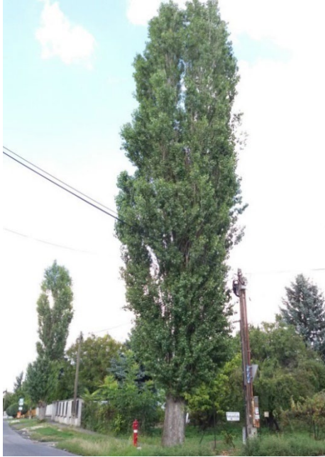
Picture 4. A columnar Lombardy poplar