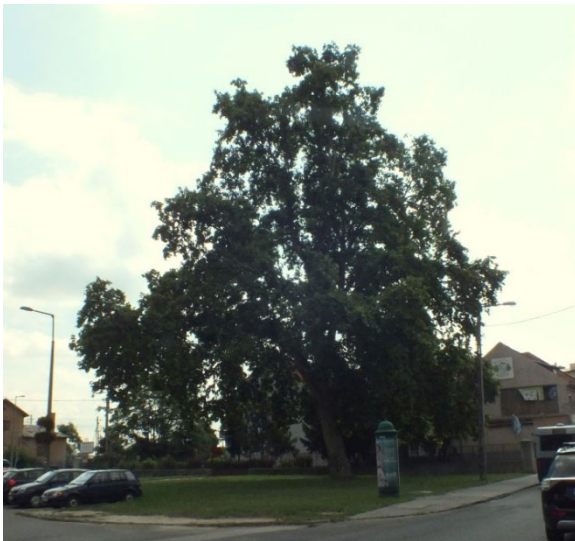
Picture 6. Large solitary trees stand out in urban squares