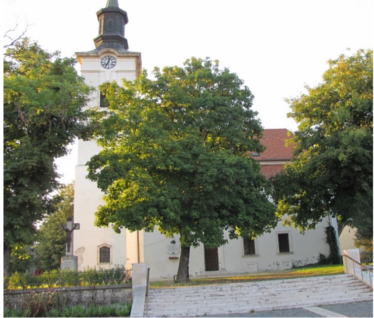
Picture 5. Its elevated location makes this tree stand out more