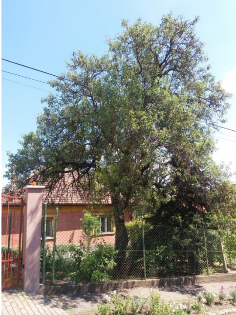
Picture 8. An old almond tree, a relic of past land uses

Our study shows that certain individual trees have a markedly increased effect on urban image and local landscape. Evaluating trees from this standpoint can give useful information for planning and prioritising management works for municipalities and public service providers. It can also raise awareness on the importance of trees located on private property, and with appropriate communication and regulatory tools, it may actively help preserve these specimens by increasing the sense of ownership and pride among owners of these remarkable trees.