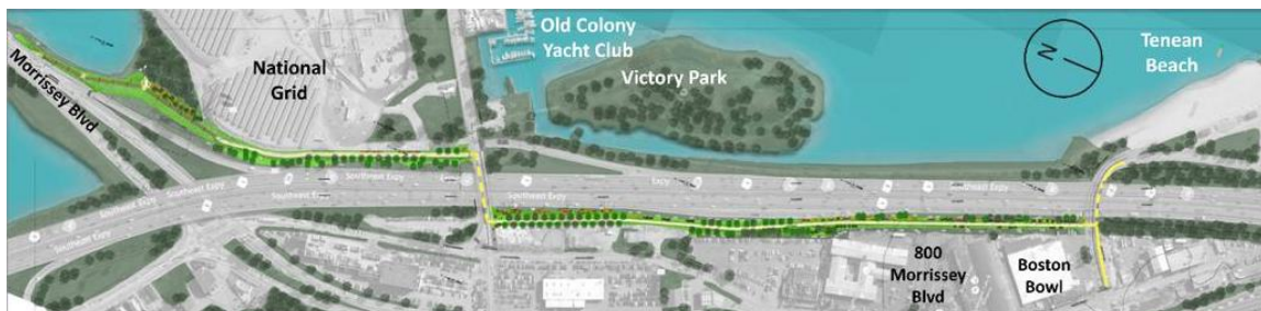
Figure 1: Neponset Greenway Tenean Beach to Morrissey Blvd

The Neponset River Greenway is an approximately 9-mile shared use pathway that connects suburban communities between the Blue Hills Reservation and Boston. Approximately 7 miles of the greenway has been completed from Neponset Valley Parkway to Senator Joseph Finnegan Park in Port Norfolk. The northern connection to Boston, Tenean Beach to Morrissey Boulevard, is currently under construction in partnership with MassDOT. The project is federally funded ($10,000,000) through the State Transportation Improvement Program and the Congestion Mitigation and Air Quality Program. The new approximately 0.9-mile section of the Neponset River Greenway will improve the habitat value of the corridor and provide a safe extension of the greenway to Morrissey Boulevard, with future connections to Castle Island. This section of trail consists mainly of an at-grade 10-ft wide paved surface, with a new, safe pedestrian crosswalk at Victory Rd, and a 670-ft elevated boardwalk structure over the tidal salt marsh in Dorchester Bay, and a large overlook deck with views of the Bay and Boston.