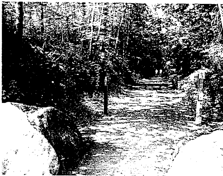
Air Line State Park Trail, Colchester, CT

This past year has seen small steps in the completion of some of our major greenway systems, including the Air Line State Park Trail and the Farmington Canal Heritage Greenway. The current budget climate has resulted in the elimination of funds for open space acquisition, which many towns had used to expand their greenways. On the positive side, many municipalities are setting up special funding for the purchase of open space and it is hoped that some funding will be restored at the state level this year.