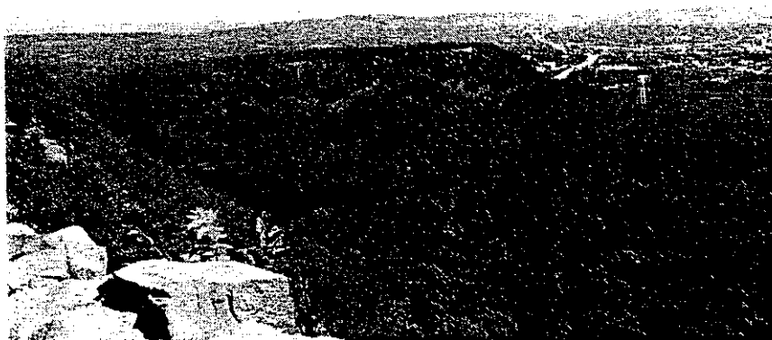
View from the Metacomet Trail, Meriden, CT