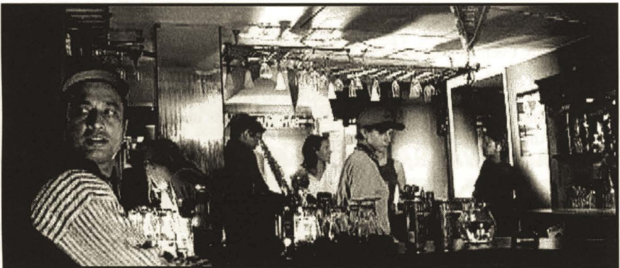
Figure 4. Followed by an inside shot of McDonalds: Kunwaara

dictions. Here we would like to indicate the dilemma of the few commercial films of this last decade that have turned their attention to Bombay as a site of collective action. One of these is phir bhi dil hai Hindustani /Ultimately We Are Indian (Aziz Mirza, 2000). Very much in the tradition of the nineties films, its central characters are young people—television reporters, whose ambitions are centered on making and spending money. However, they are disillusioned by their consumerist lifestyle and come to fight for the life of a man wrongfully sentenced to death by a corrupt government. At the end of the film, they get people out into the streets to prevent the hanging—and this is where we see Bombay again. While the imagery is strongly nationalist—with people waving flags—nationalism is interpreted as the ability of people to organize and act politically and take charge of the nation , to set it back on the original promise written into the constitution: secular, socialist, de-