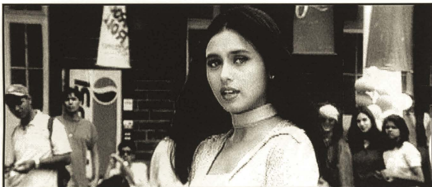
Figure 1. The college courtyard in Kuch Kuch Hota Hai flanked by balloons and Pepsi.

working class immigrants experienced in Bombay. In the end, the criminal brother would be killed. However, his end would be mourned as the death of a brave and ultimately honest man whose poverty and social alienation had forced him into turning violent. In the recent Kaho na Pyaar hai/Tell Me That You Love Me (Rakesh Roshan, 2000), this motif is updated. The film's protagonist is killed and his beloved finds his look alike, not brother, in far away New Zealand. Furthermore, the story stays clear of situating the protagonist's dilemmas in social circumstance. Instead, the film is cast as a psychological thriller setting up individuals as driven by their internal psyches rather than their social situations. The fictitious world of Bombay film was beginning to get smaller, atomistic and privatized!