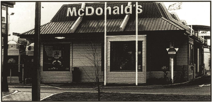
Figure 3. Opening shot establishes the location as a McDonald's: Kunwaara .