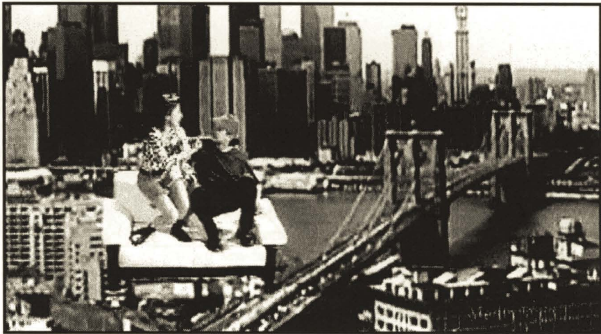
Figure 2. The lovers fly over New York City: Rangeela

of these new film-homes continued to be as fantastical as before but with two added features: a swimming pool in the living room and, if there was a child character in the film, a playroom filled up with cuddly toys. The playroom invented the child as a consumer, with its own room and possessions, while the swimming pool launched the new image of the large extended family—as fun-filled and open to consumption rather than authoritarian and constraining, one disciplined for production. The patriarch in this new fun-filled family is still tied to the disciplinary regime of production—the industrialists and their elder sons still run the businesses—but the women, children and the grandparents revel in an endless celebration of rituals and merrymaking.