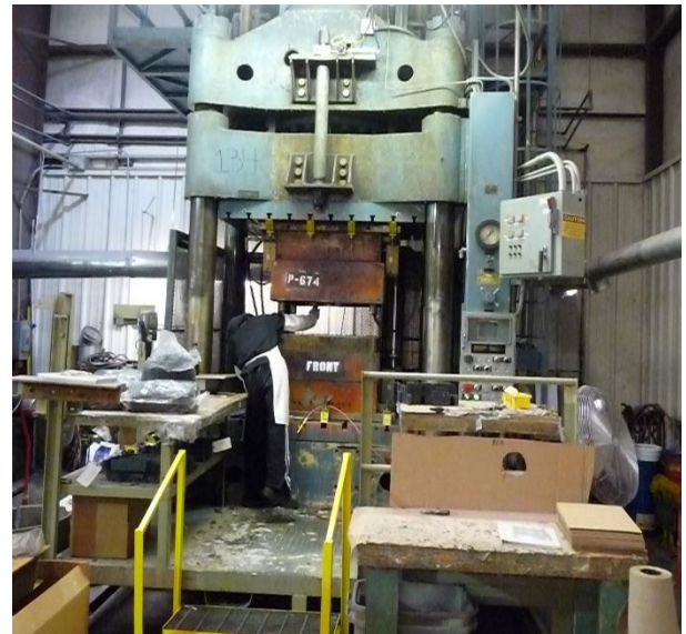
Figure 3 | Large press for compression molding thermoset plastics. Penn Compression Molding is a CM and focused on manufacturing with thermoset plastics.

The benefits of using a CM for manufacturing is flexibility and increased specialty. CMs can handle the uneven demands for units and small production runs by balancing its workload through multiple contracts. In contrast, a product manufacturer not using a CM would need to sell enough product run to operate its facility year-around. Unlike OEMs that make complex products assembled from different parts, CMs focus on a limited number of manufacturing processes such as Penn Compression Molding that does compression, transfer, and injection molding with thermoset, reinforced plastics.