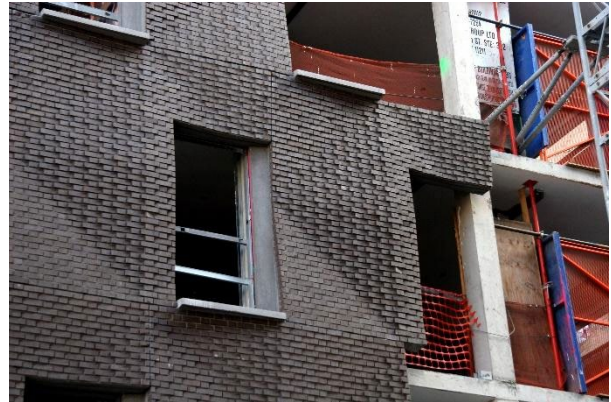
Figure 2 | SHoP Architects. 290 Mulberry Street. 2010 New York City. October 4, 2008.

casting can use wood patterns and sand molds for low-volume productions, or hardened tool steel molds for high-volume productions.