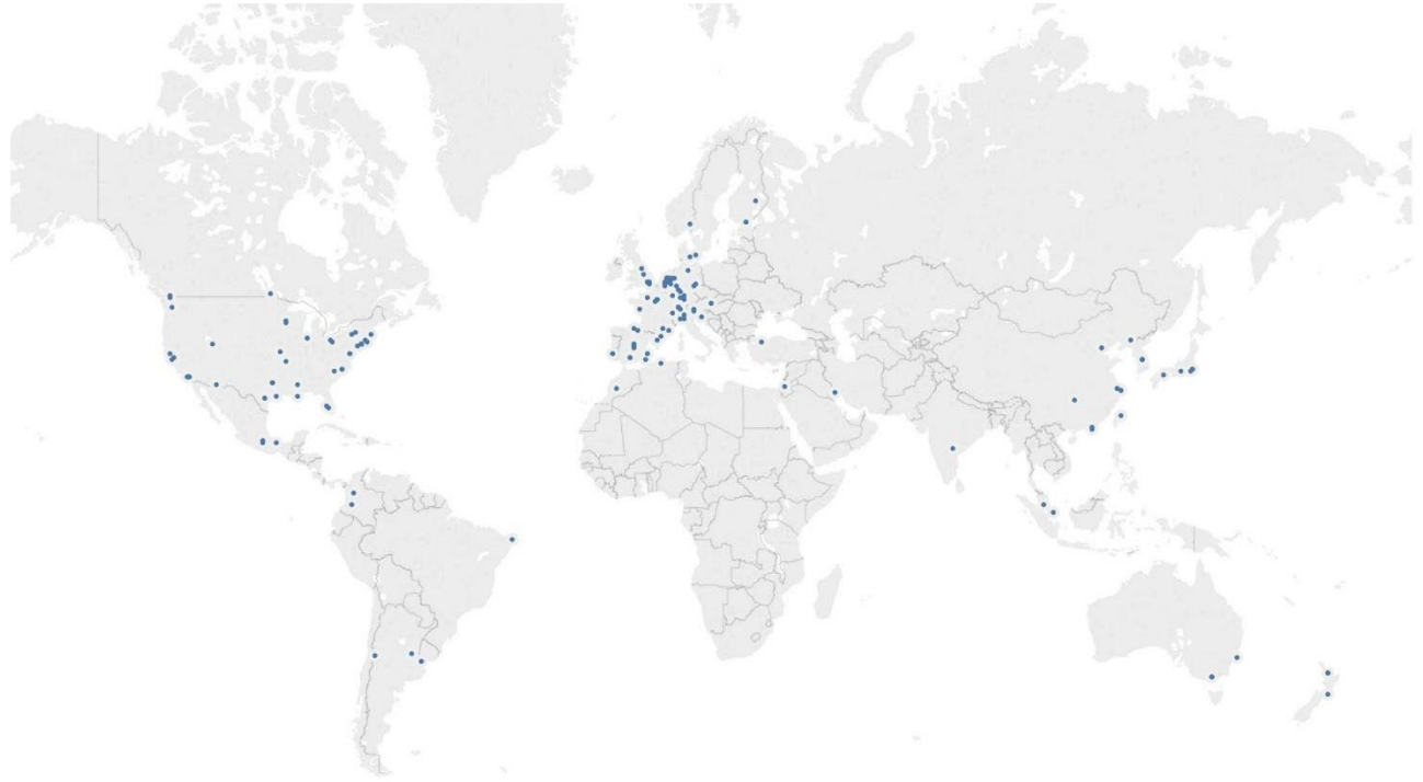
Figure 1 | World Map of CRM in Architecture – locations of built case studies

We define ‘ manufacturing ’ as to make from raw or unformed materials by hand or by machinery, especially when done systematically.