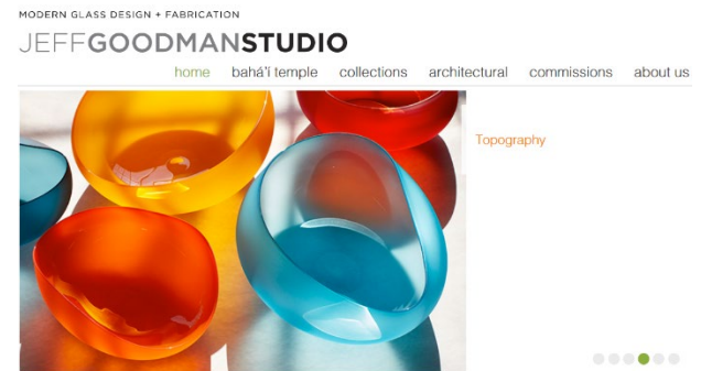
Figure 3 | Jeff Goodman Studio website. 2019 < http://www.jeffgoodmanstudio.com/ > Accessed 19 February 2019.