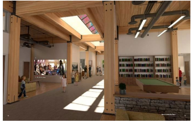
Fig 5. An interior rendering of the Masters level project showing a high level of engagement with the materiality of the glulam and CLT system and the impact of its materiality on the aesthetics of the space.