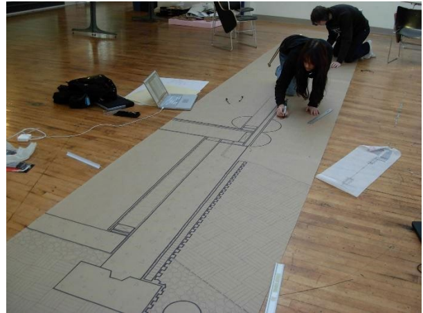
Fi. 2. First year undergraduate students drawing a full scale wall section of a small wood framed building.

address constructability and construction sequencing. The full scale wall section makes them aware of the scale of building materials without the expense and trouble associated with managing a design/build type project at this early stage. It also forces them to confront detailing for the first time in a manner that requires a lot of thought. It is easier to fudge details at a smaller scale and remain unaware of the relationship between materials. The attitude that I attempt to have them understand when they are making these drawings is that they are not actually creating a “drawing” but rather, a building. The type and nature of this challenge works well as an introduction to structural design thinking.