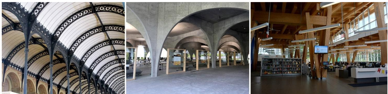
Fig 1: Ste. Genevieve Library, Paris (iron), TAMA Art Library, Tokyo (reinforced concrete); Scarborough Library, Toronto (timber). As can easily be seen by the above three images of libraries, materiality plays strongly into form, feeling and detailing in spite of programmatic similarities. A high level understanding of materiality was required of the architect.

Studio projects are often program-based rather than material-based explorations. In an age of increasingly complex design, there has been a pedagogical tendency to avoid the constraints imposed by a highly formalist narrative and this seems to have largely precluded the specification of a directed structural palette within a design studio. Students are intentionally left free to explore form based on programmatic requirements. However, students often run into difficulties when attempting to apply structure (after the fact) to a project after working out spatial and volumetric relationships. This can compromise the plan, the structure and the design in a forced-fit scenario.