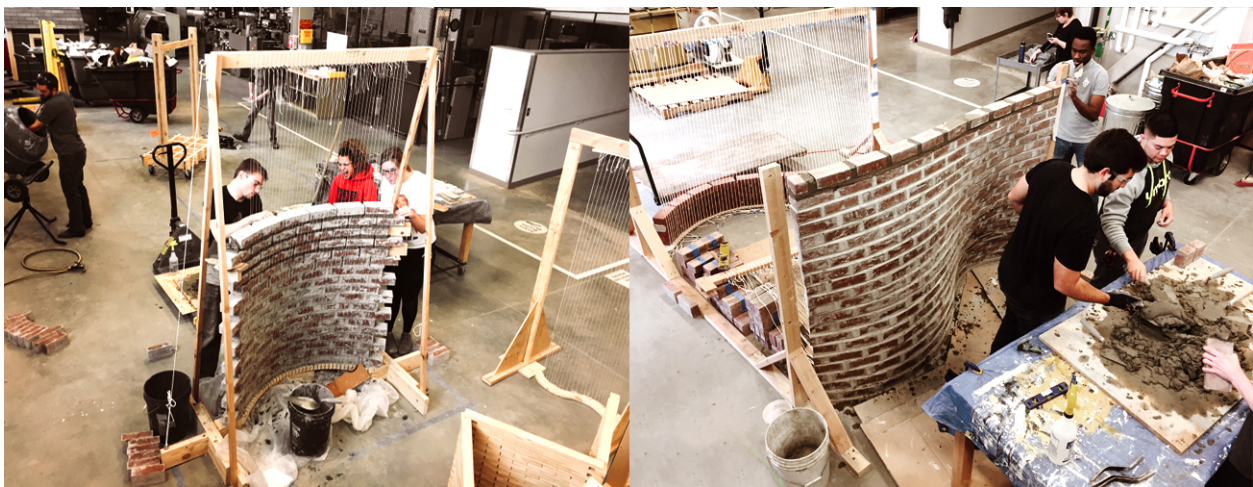
Fig. 4. Dieste Building Shop - Ruled Surface Wall Construction

Machines foreground two primary systems of translations, direct and transfer . These two systems are analogous to the two ways of thinking about time and technics outlined in the previous section of the paper. Direct translation systems generate a translation directly from an original language to another language with no intermediary form of representation. Transfer systems are typically more complex than direct translation because they integrate forms of syntactic analysis, which expand the content of the original language, avoiding direct one-to-one translations. 20 These two approaches to translation are not mutually exclusive. When overlaid onto Alberti’s authorial paradigm, the instrumentality of orthographic representation becomes a direct system of translation, while Negroponte’s thinking machines become types of transfer systems . This is an acknowledgement of the differences between each system; it is not a value-judgment.