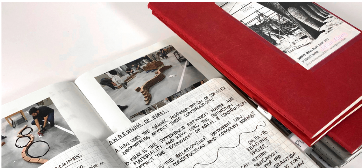
Fig. 2. Dieste Building Shop - Student Journals

Dieste Building Shop is a combination of history/theory seminar and building technology class. The combination puts students in close proximity to the theoretical underpinnings of Dieste’s practice and his attitude towards labor. The work of reading is an essential part of this course. Reading Dieste’s writings about the role of workers is a precondition to understanding the labor-centric aspects of Dieste’s thinking and it is a way to link intellectual work with subsequent forms of physical labor. Reading discussions and questions are recorded in individual student journals (Fig. 2). The journals are formally and informally reviewed on a biweekly basis. During formal reviews, students submit their journals to the instructor, while informal reviews consist of students exchanging journals with each other. Both types of reviews are ways of prompting discussions around issues that affect the trajectory of the course. The journals become a way to visibly trace physical labor and reflect on its implications. Each journal is an individual reflexive document and a collective record of the semester’s work.