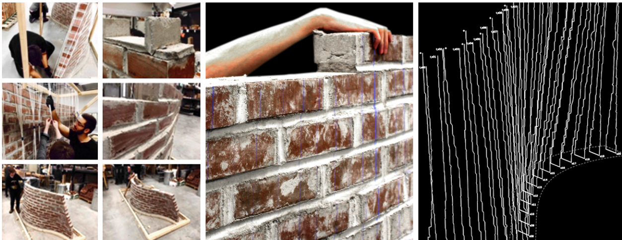
Fig. 3. Dieste Building Shop - Wall Deconstruction

The notion of ideas existing apart from their technical formation is a precondition of the traditional dominance of work over labor . “The kind of people that are captivated by a machine-driven society of the future and theorize about it are usually not people that do things...someone has to design the prototypes and processes.” 17