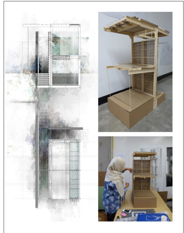
Figure 3. Drawings and 1'=1'-0' scale physical models studying structural systems in their design work. (Anggitta Nasution-Zurman, Fall 2015)

using representative materials to capture materiality in the physical model (Figure 3). The size of the physical model is critical because of its direct association with the typical scale of building details drawn in professional practice. The physical models needed to be large enough to delve into the assembly and the component scale of structure while also small enough to be manageable for a student to build in three weeks.