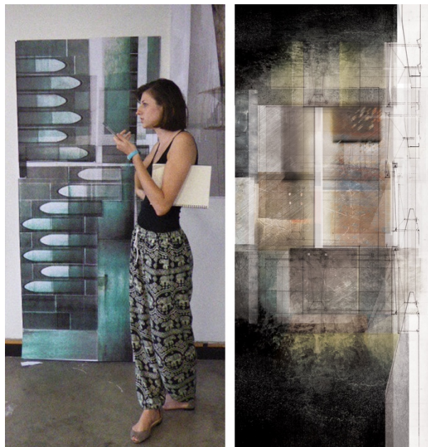
Figure 1. Full-scale drawings of invented light conditions. (Elizabeth Cronin, Sara Vecchione, Fall 2015)

three-dimensionality through shadows. The full-scale drawings need to capture dynamic light and not just a static moment in time.