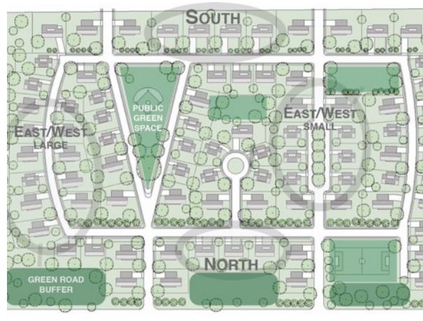
Figure 7: Subdivision design with PSDH homes

40 degree swing creates greater flexibility in house orientation than the stricter direct north-south orientation recommended for passive solar houses. Without the requirement of only straight, north-south oriented streets, roads can be gently curved and angled, which when combined with pocket parks and green spaces, relieves a relentless grid. (Figure 7) PSDH’s energy efficiencies don’t make sense without sustainable land use as well. Typical suburban sprawl master plans often use large half-acre lots; more land than usually needed by the owners. The Charleston House model, with its large side yard, allows for smaller 1/6 to 1/4 acre lots. The increase in density can nearly double the number of houses in a subdivision (from 45 to 86 in the site plan shown) while maintaining the same overall amount of public green space and creating walkable, livable neighborhoods. With more houses to sell per acre the developer could potentially offset increased capital costs with an increase in total home sales.