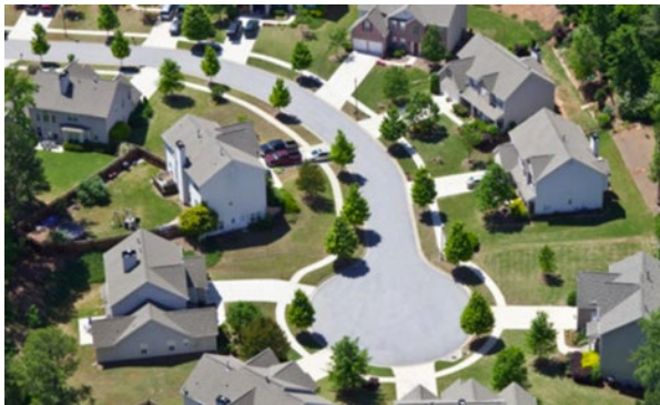
Figure 1: Houses Face Street Regardless of Sun Direction

a measurable effect on our environment. However, a million passive house starts a year could have profound effects on our ecosystems. With the looming specter of climate change and the potentially catastrophic impact, can architects ethically continue to ignore the problem as it grows into a major environmental concern? This design/research paper investigates the reasons for this disconnect between architects, large housing developments and sustainable energy, and then identifies potential design strategies for improvement.