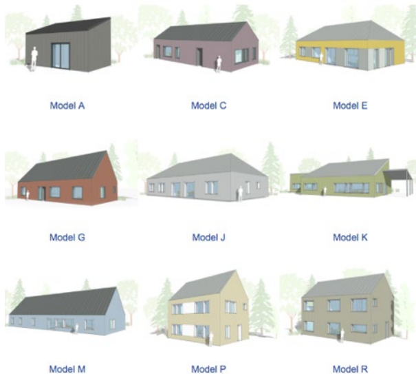
Figure 8: Passive Home Model Option, Pendranti Architects

large number of combinations would help provide initial variety, and owner modifications over the ensuing years would provide additional character and neighborhood identity. Richard Pendranti Architects, an architecture firm that works with Ecocor, has already created a portfolio of basic passive house models that can be adapted to each individual client. 20 Models vary in size, number of stories, roof shape, exterior material finishes to allow for a wide variety of combinations. (Figure 8) Like with the prefabricated GO Home, the next step would be to scale this idea up to the level of the suburban development which is already well versed in the process of mass customization.