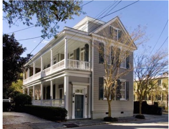
Figure 2: Charleston House Type

harder to achieve with typical wood frame construction common to developer homes.