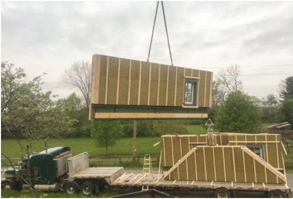
Figure 6: GoHome Panelization House Assembly Process

relatively expensive because of the increased amount of construction materials and each house is constructed as an individual home. However, the efficiency of scale that developers like Toll Brothers can provide through mass production and factory prefabrication could improve cost efficiency to make pricing more affordable.