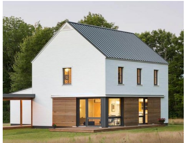
Figure 5: Passive GO Home Model, GoLogic

prefabricated passive homes they call GO Homes that are in styles similar to what suburban buyers want. 16 (Figure 5) While not expensive one-off designs, these homes are still built one at a time and located on large rural sites. The challenge is to scale up this idea to the level of the developer subdivision to improve affordability.